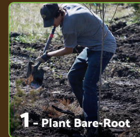
1 - Plant Bare-Root