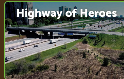
Highway of Heroes