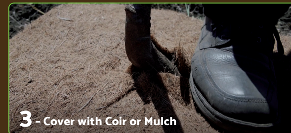
3 - Cover with Coir or Mulch