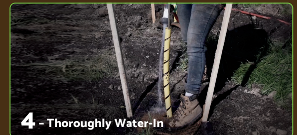
4 - Thoroughly Water-In