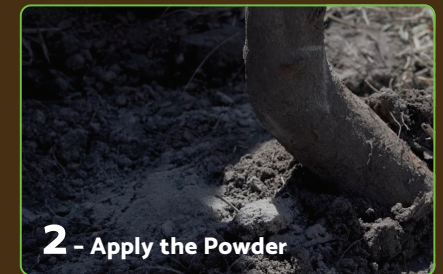
2 - Apply the Powder