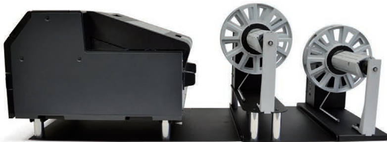
Epson C6500P printer - LABEL UNWINDER (UW6500P) - LABEL REWINDER (RW6500P) (Not included)

The Roll to Roll system specifically designed for Epson C6500P color label printer can handle rolls up to 8.66" (220mm) media wide and having an outside diameter up to 10" (250mm). Both Unwinder and Rewinder are equipped with a fixed 3" core holder.