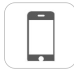
Max. 27W for phone charge