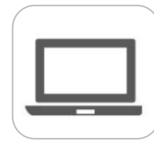
Max. 60W for laptop charge