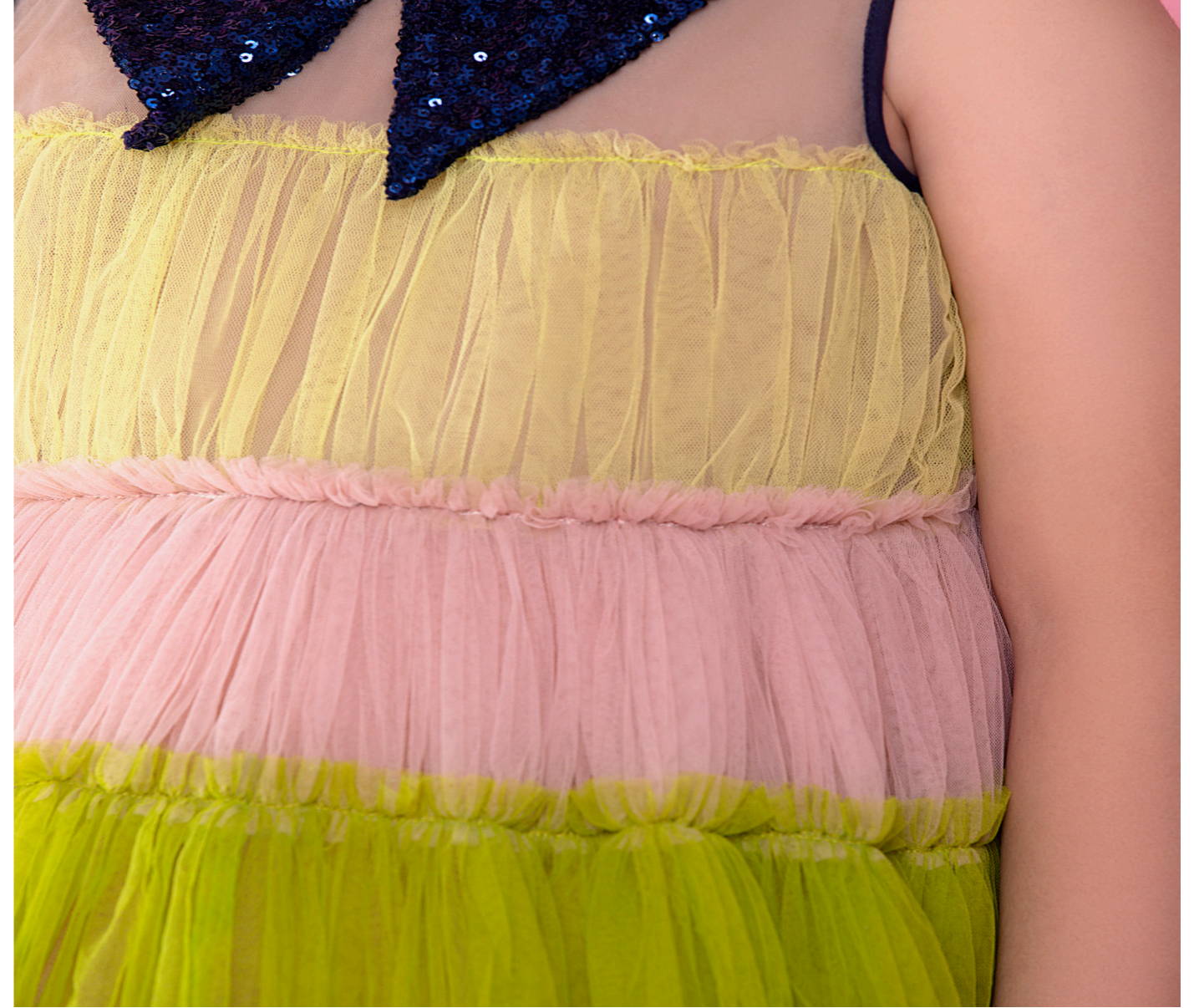
Fabric Material: Butterfly Net, Sequin georgette Color: Multicolor