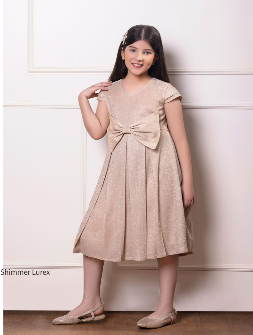
Fabric Material: Golden Shimmer Lurex Color: Golden