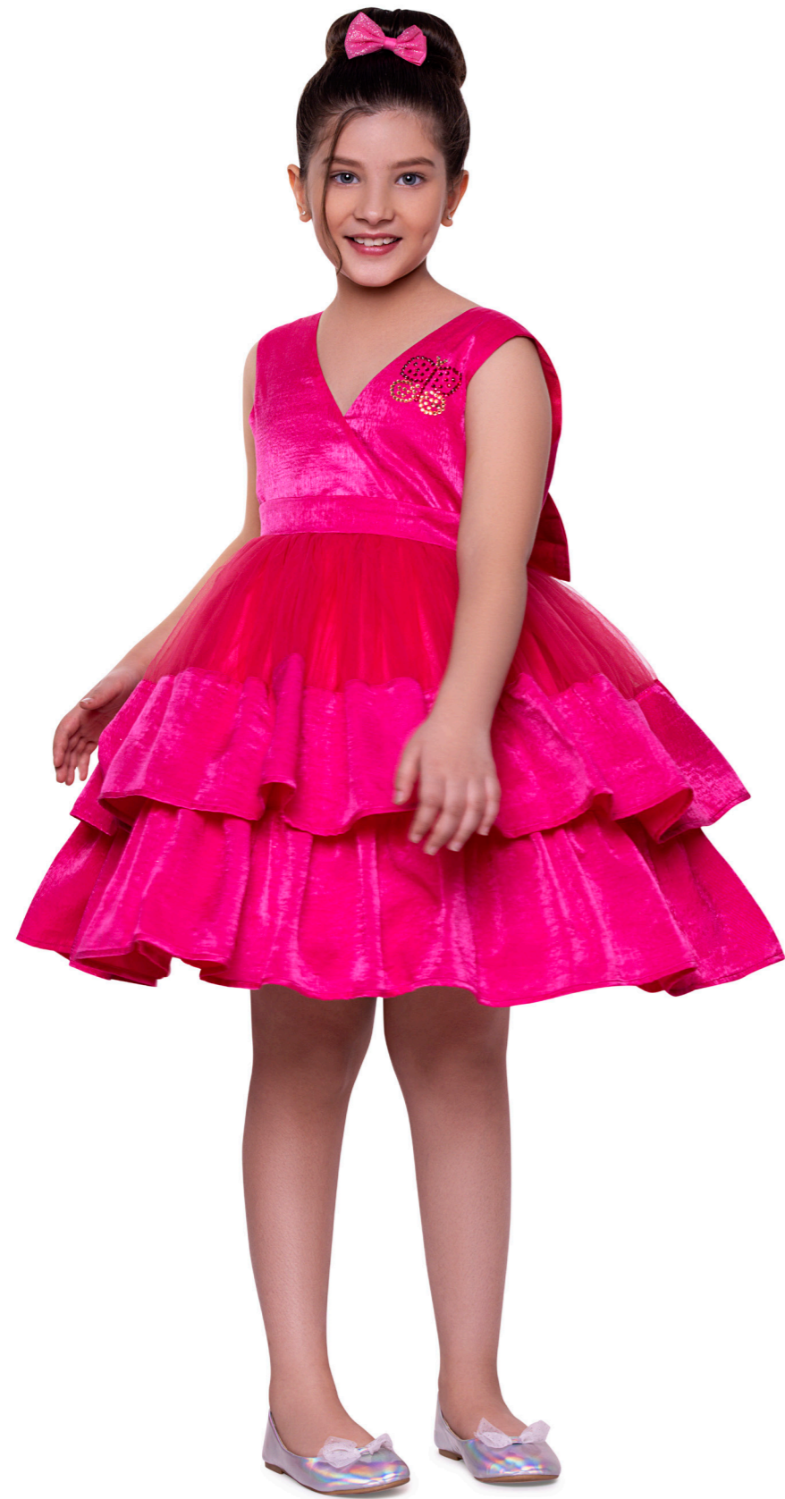
Fabric Material:Sandwash Satin, Butterfly Net Color: Pink