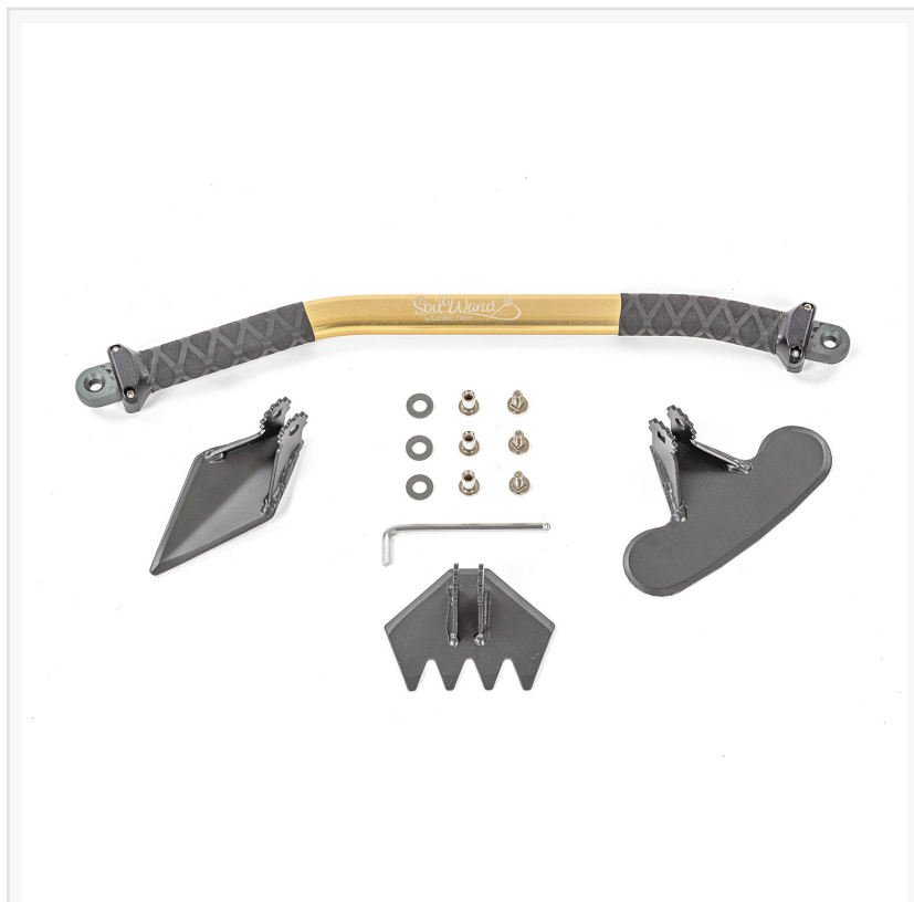
SoilWand Garden Hand Tool System

weeding in mixed beds, on slopes, and in tight spaces, SoilWand is the ideal assistant for many challenging gardening tasks. SoilWand's adjustable attachments make turning soil as easy as 1-2-