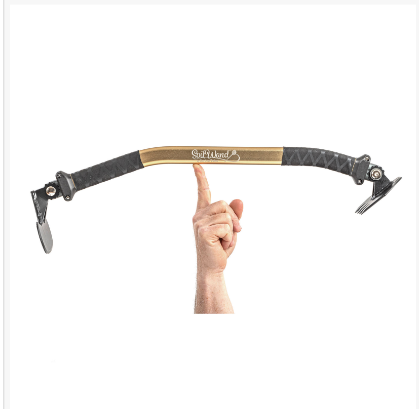
Lightweight SoilWand Garden Hand-Tool System