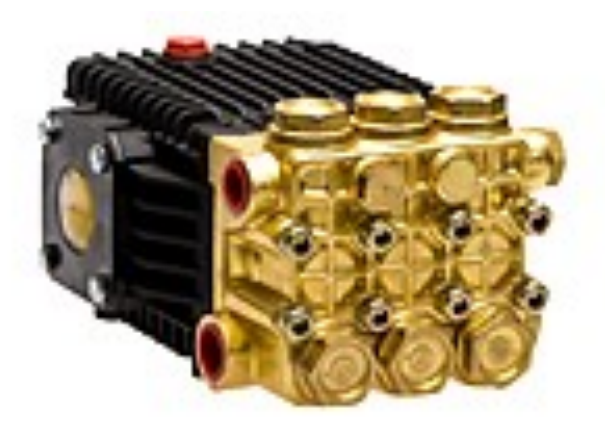
57058 REPLACEMENT BARE PUMP for PUMP MODEL 50099-HDE 57060 REPLACEMENT BARE PUMP for PUMP MODEL 50100-HDE—50200-HDE

Please contact Smart Mist USA for service or replacement parts.