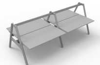
4 Pack Back 4PB