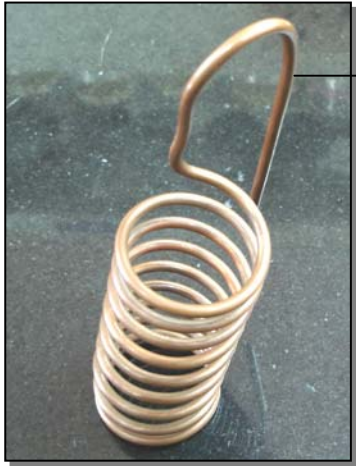
Figure 3: Copper device for treating 10 l of water

Convenient hook to hang the device inside containers