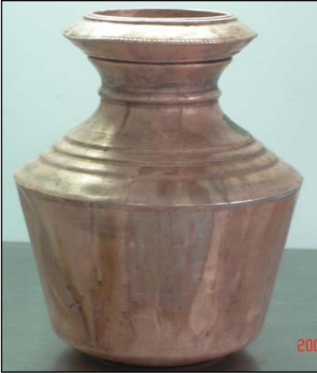
Figure 1: Copper pot used for storing water