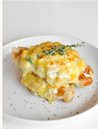
KOREAN CORN CHEESE

Croffle : Crunchiness of a waffle with buttery layers of a croissant