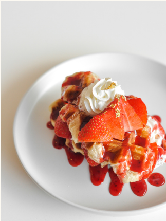
STRAWBERRY & CREAM