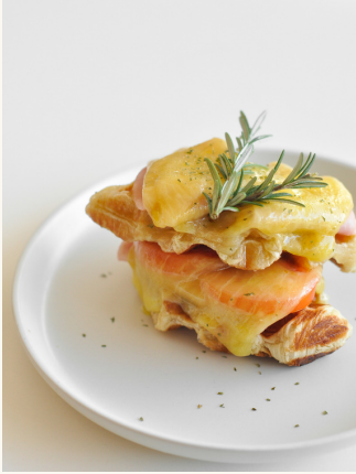
HAM, CHEESE, TOMATO