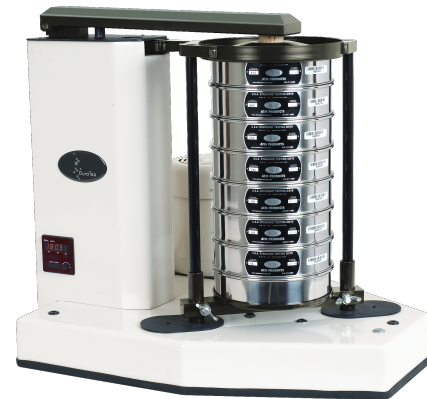
H-4321.5F Dura Tap™ Sieve Shaker