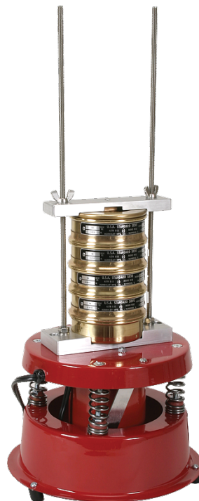
H-4326.5F Sieve Shaker for 3" Sieves