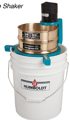
H-4328.5F Wet/Dry Sieve Shaker