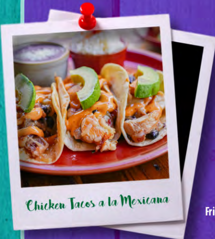
Chicken Tacos a la Mexicana

Grilled fish with red onions, pico de gallo and cilantro cream.