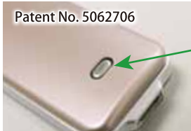
Patent No. 5062706

The test result revealed that the IONION MX decomposed and absorbed 99.9% of the fine particles (PM2.5) when it was operated in a confined space.