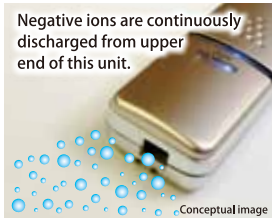
Negative ions are continuously discharged from upper end of this unit.

Chemicals and other substances such as dust, viruses, pollens, and fine particles (PM2.5) floating in the air are positively charged. People also tend to be positively charged in the modern lifestyles they lead surrounded by electrical appliances and synthetic fibers. Such chemicals and other substances are in a suspended state all the time. As a result, we live in an environment where we liable to breathe in such substances. The primary function of general negative ion generators sold on the market is to neutralize this positive charge only. On the other hand, the IONION MX is an ultra-small negative ion generator that can protect users from chemicals and other substances by wrapping their bodies in an ion barrier, using patented technology that negatively charges the surface of the body.