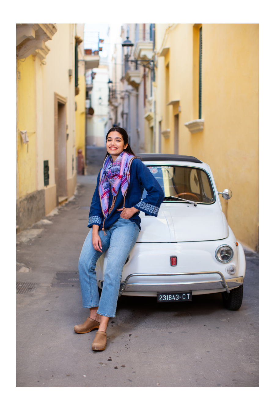
CATALINA LINEN LONG DRESS ANTIQUE PINK SINEAD