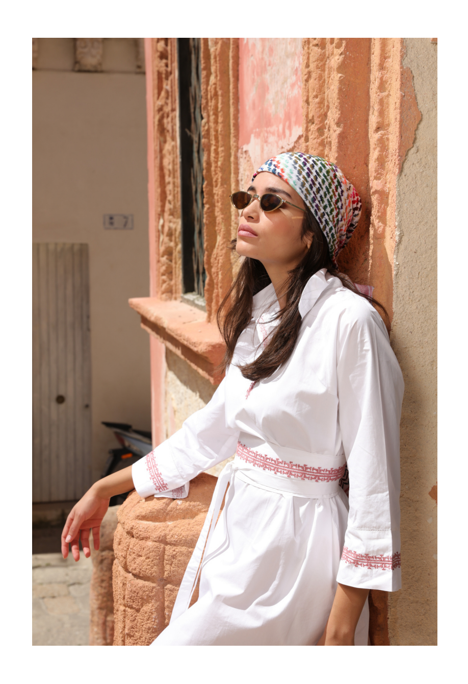
POLO COLLAR | WHITE SHORT COTTON DRESS | PINK IBRAHIM