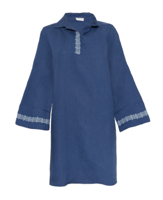
POLO COLLAR | INDIGO BLUE SHORT LINEN DRESS | IBRAHIM