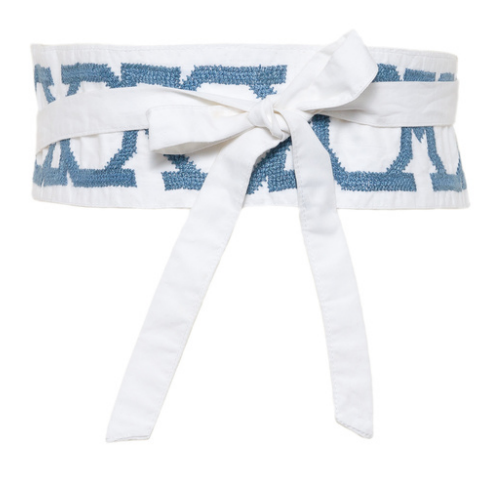
WHITE COTTON OBI BELT