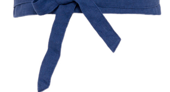
INDIGO BLUE LINEN OBI BELT