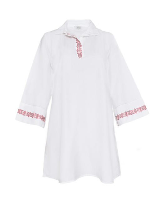
POLO COLLAR | WHITE SHORT COTTON DRESS | PINK IBRAHIM