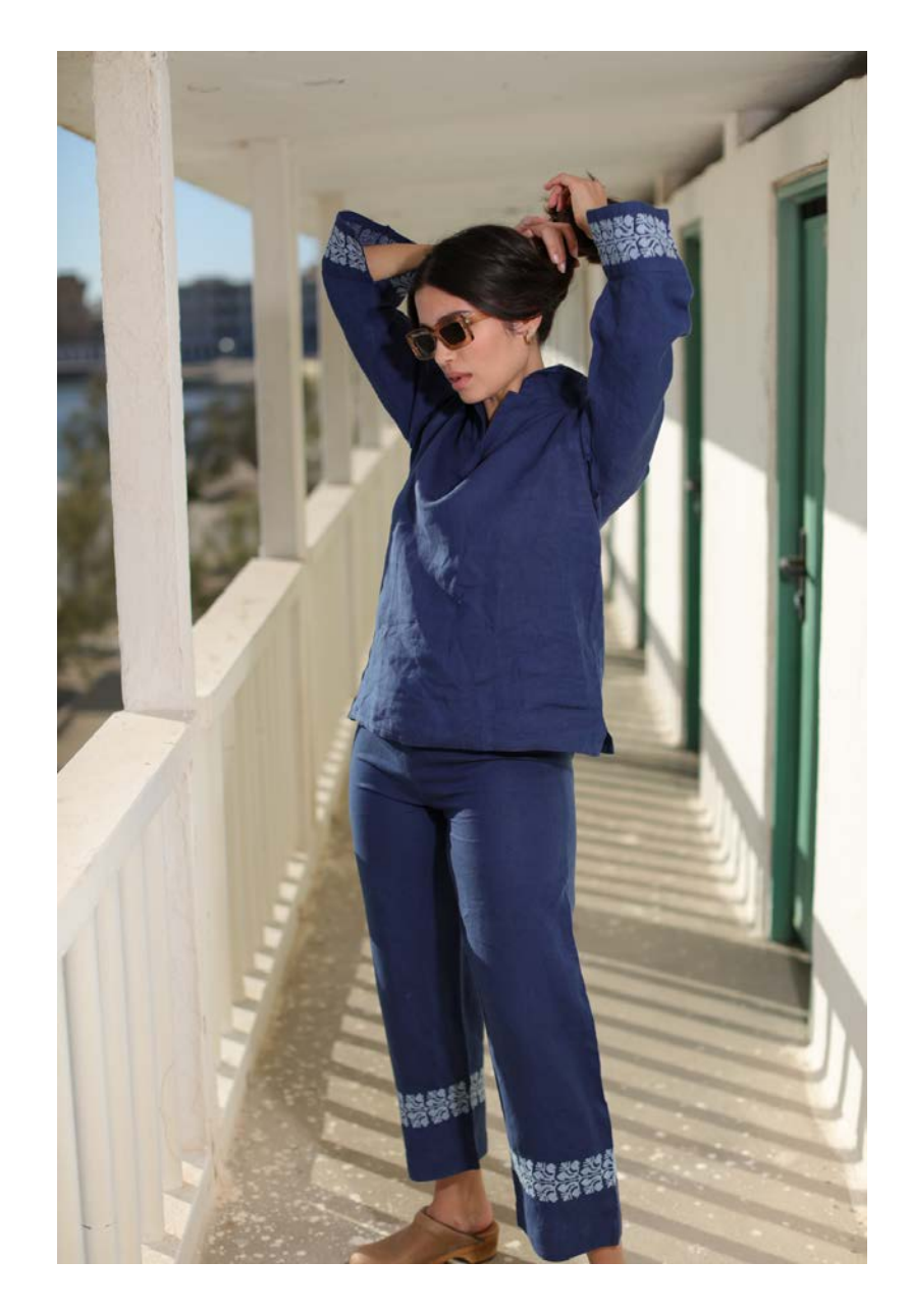
POLO COLLAR | INDIGO BLUE LINEN A-SHAPE TOP | SINEAD INDIGO BLUE LINEN PALAZZO PANTS | SINEAD