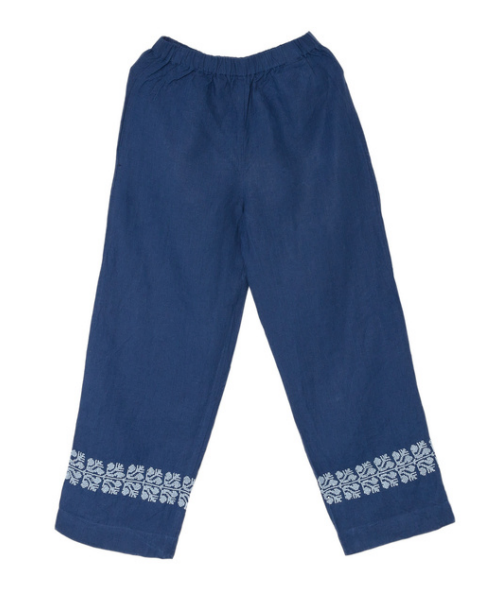
INDIGO BLUE LINEN PALAZZO PANTS | SINEAD