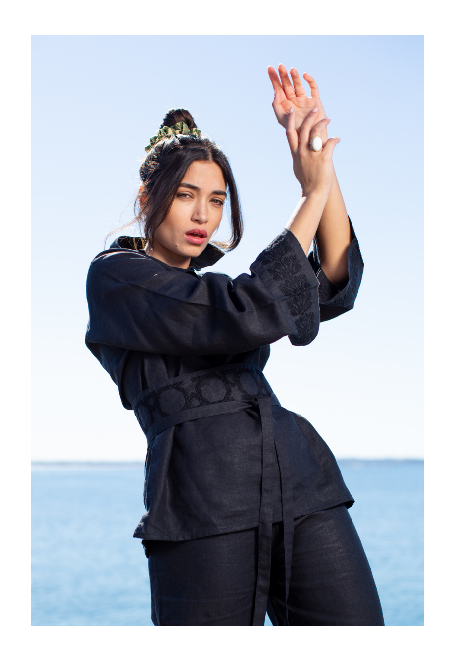
POLO COLLAR | BLACK LINEN A-SHAPE TOP | SINEAD BLACK LINEN PALAZZO PANTS | SINEAD