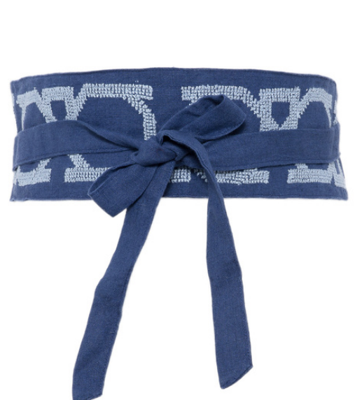
INDIGO BLUE LINEN OBI BELT