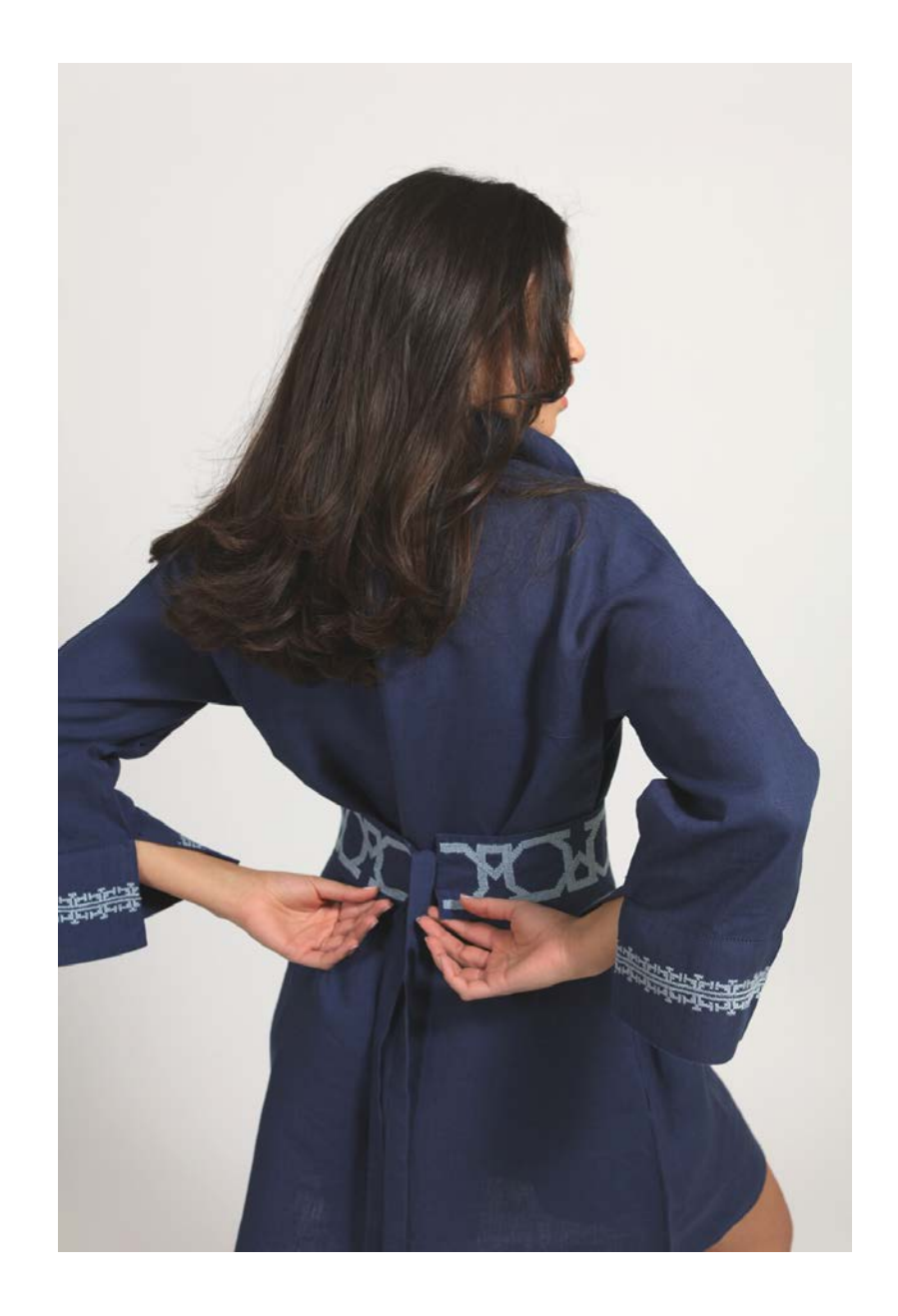
POLO COLLAR | INDIGO BLUE SHORT LINEN DRESS | IBRAHIM