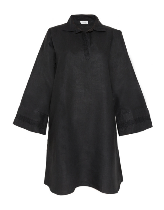
POLO COLLAR | BLACK SHORT LINEN DRESS | IBRAHIM