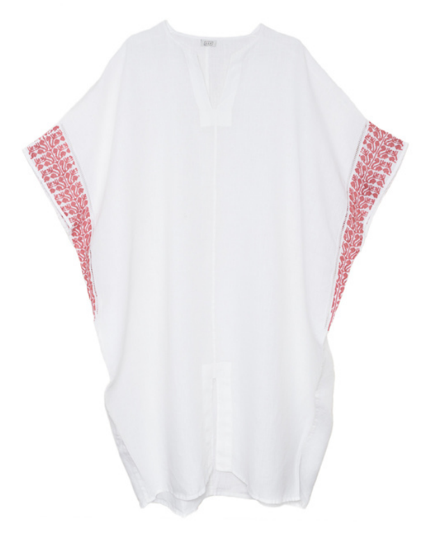
CATALINA LINEN LONG DRESS ANTIQUE PINK SINEAD