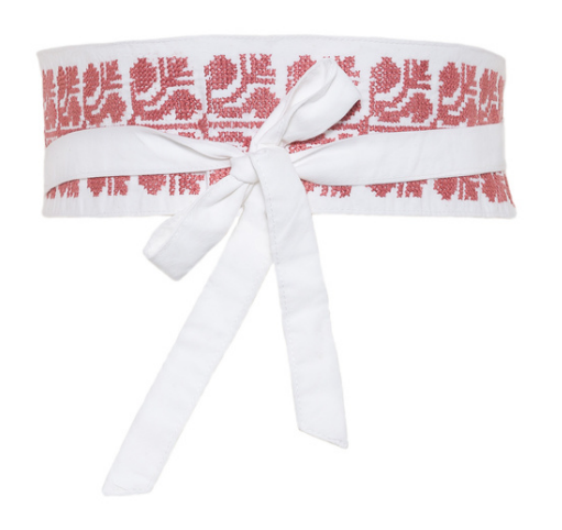
WHITE COTTON OBI BELT