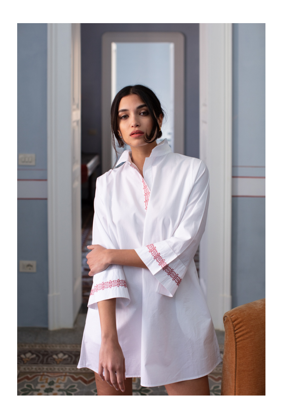
POLO COLLAR | WHITE SHORT COTTON DRESS | PINK IBRAHIM