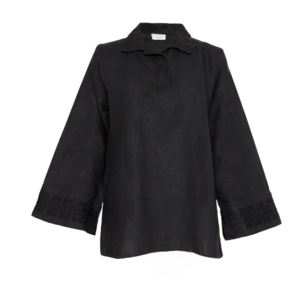
POLO COLLAR | BLACK LINEN A-SHAPE TOP | SINEAD