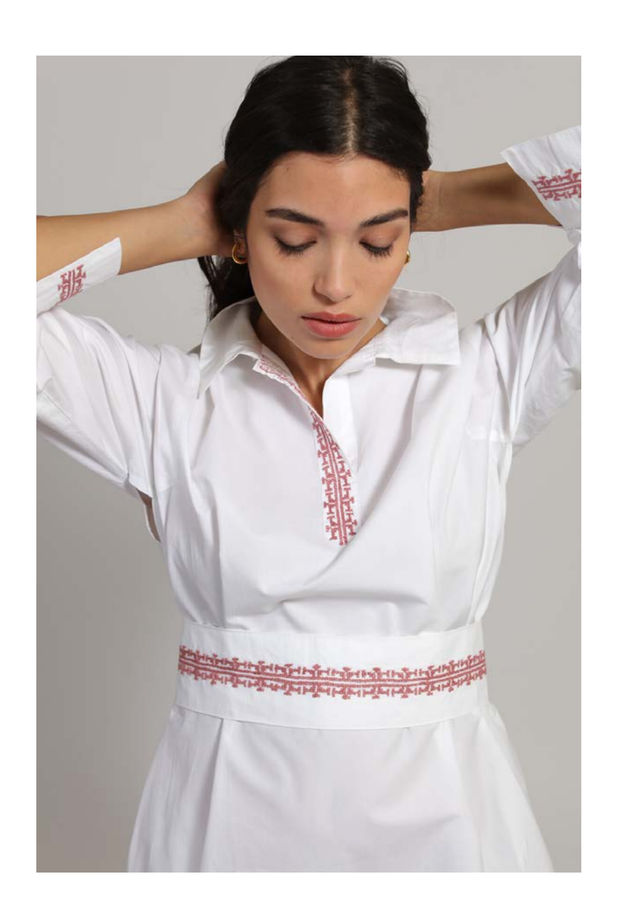
POLO COLLAR | WHITE SHORT COTTON DRESS | PINK IBRAHIM