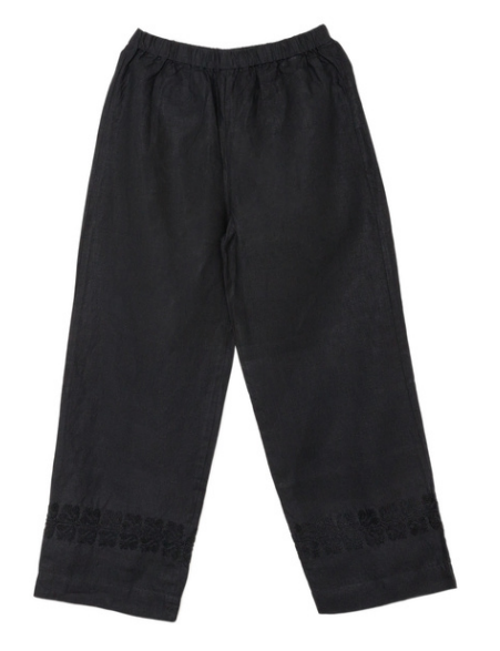
BLACK LINEN PALAZZO PANTS | SINEAD