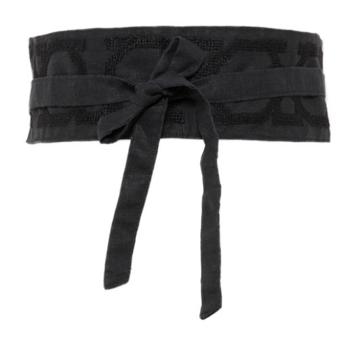
BLACK LINEN OBI BELT