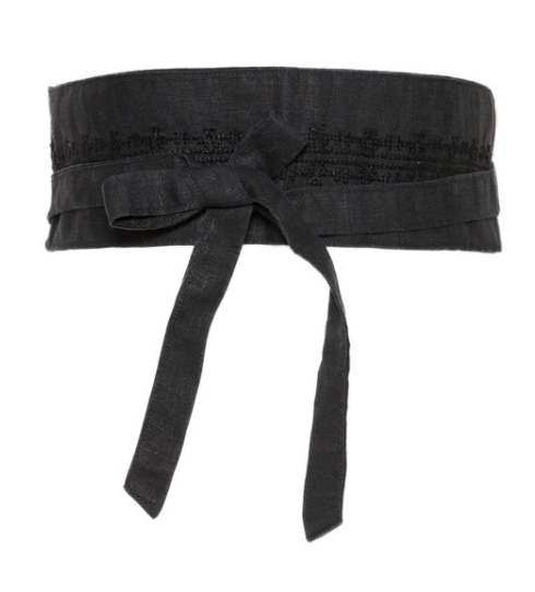
BLACK LINEN OBI BELT