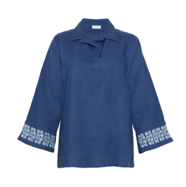
POLO COLLAR | INDIGO BLUE LINEN A-SHAPE TOP | SINEAD