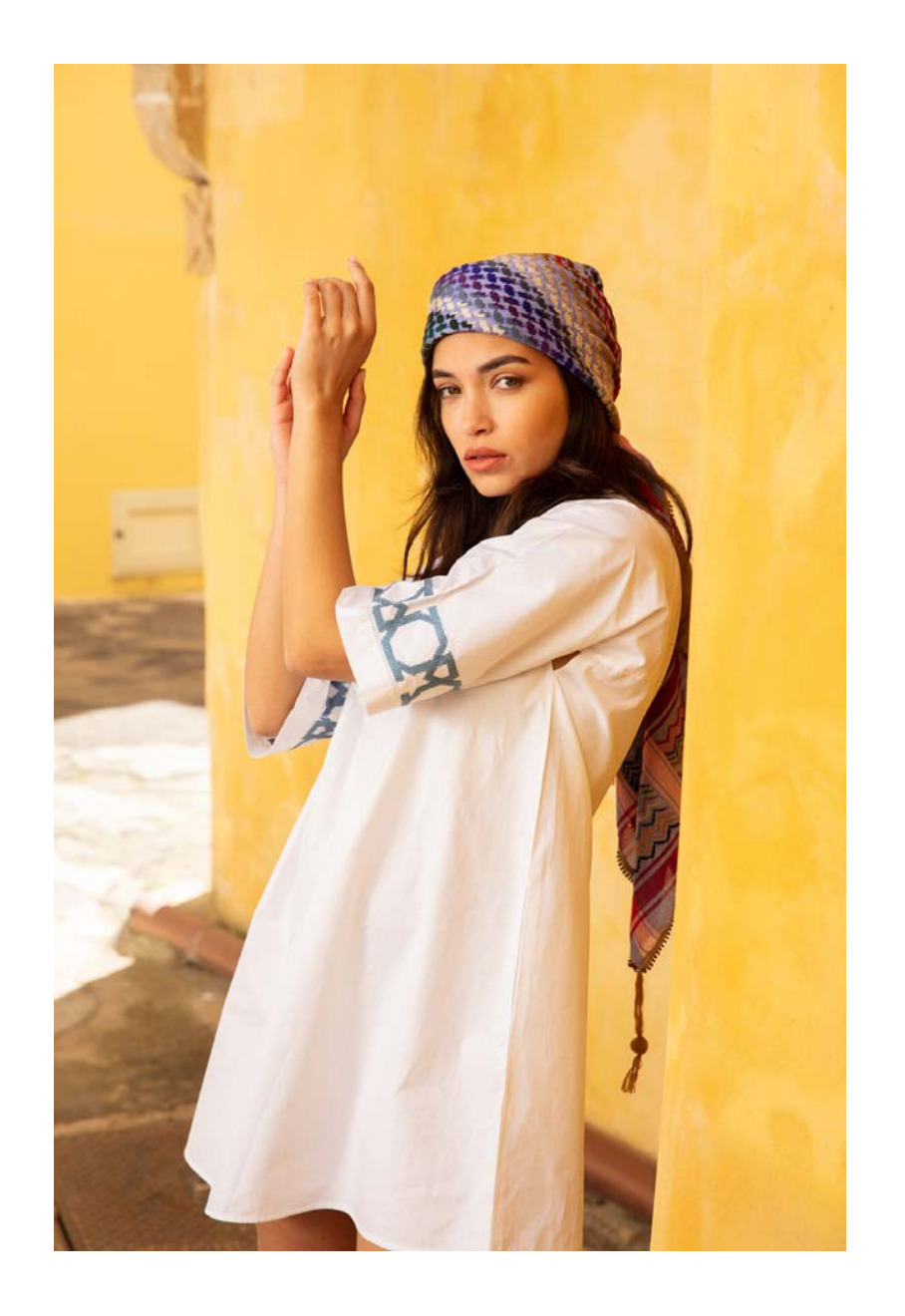
ESMERALDA | WHITE SHORT COTTON DRESS | BLUE AL QUDS