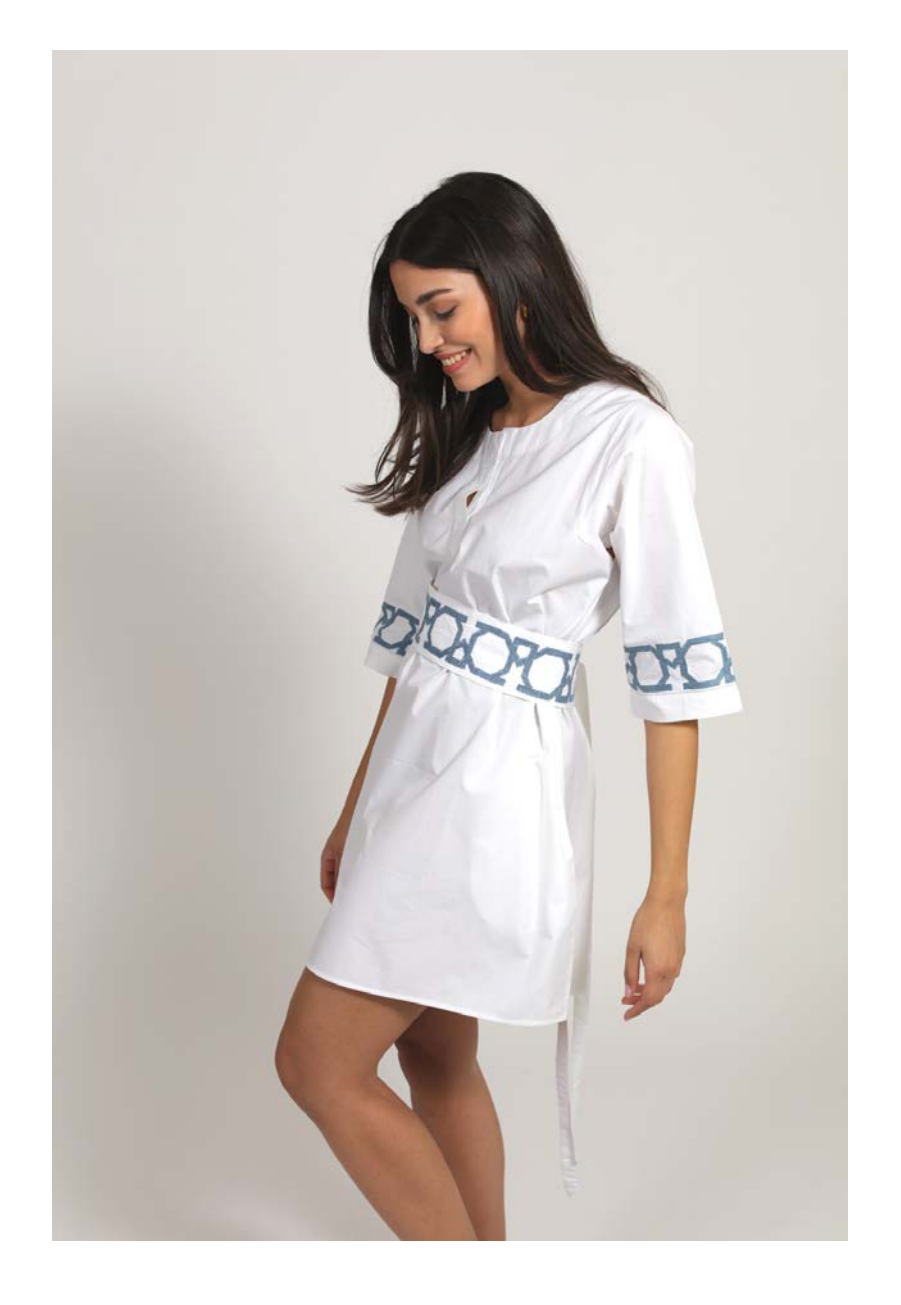
ESMERALDA | WHITE SHORT COTTON DRESS | BLUE AL QUDS