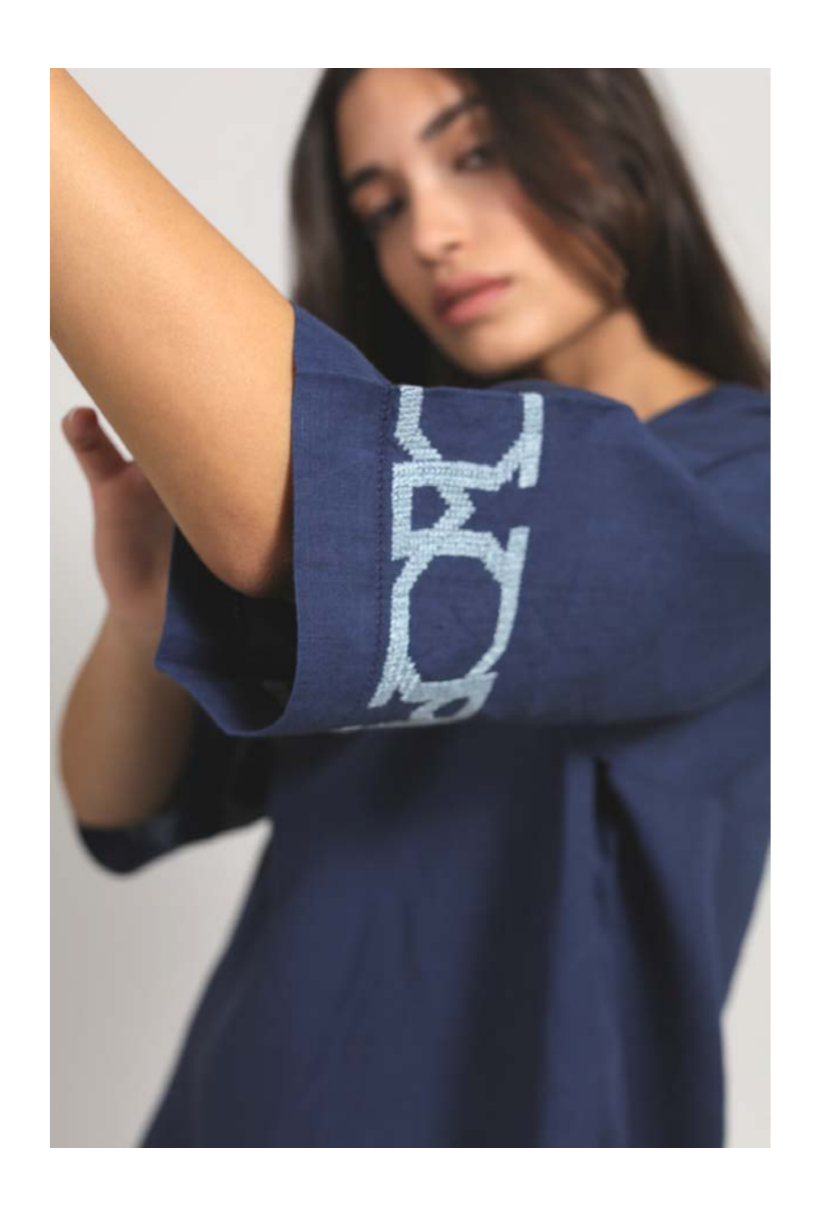
ESMERALDA INDIGO BLUE SHORT LINEN DRESS AL QUDS