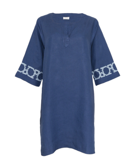
ESMERALDA INDIGO BLUE SHORT LINEN DRESS AL QUDS