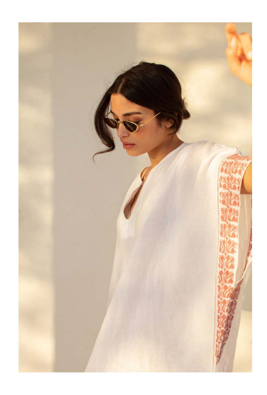
CATALINA LINEN LONG DRESS ANTIQUE PINK SINEAD