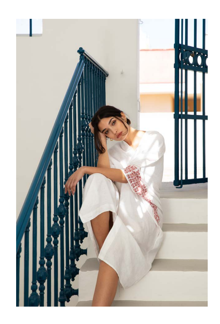
CATALINA LINEN LONG DRESS ANTIQUE PINK SINEAD