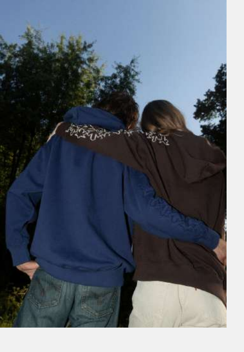
I do believe that the best way to be different, is to make a difference.