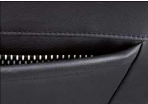
Detail map pocket