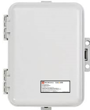
Dimensions (in): 9x6x3