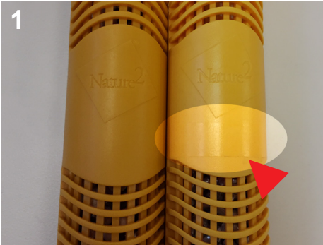
LEFT Counterfeit Spa Stick RIGHT Genuine Nature2 Spa Stick

To ensure you have a genuine Nature2 Spa Stick, we advise you to check your product for the following: