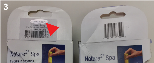
LEFT Counterfeit Spa Stick Packaging RIGHT Genuine Nature2 Spa Stick Packaging