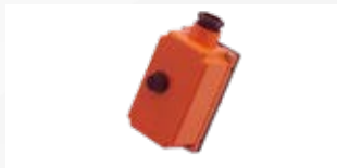
Hi Limit Single Thermostat