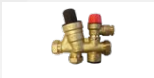
Inlet Control Group