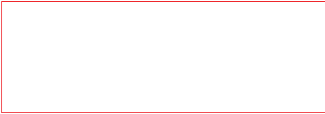
LEFT SIDE HALF WALL (PRINTED OUTSIDE)