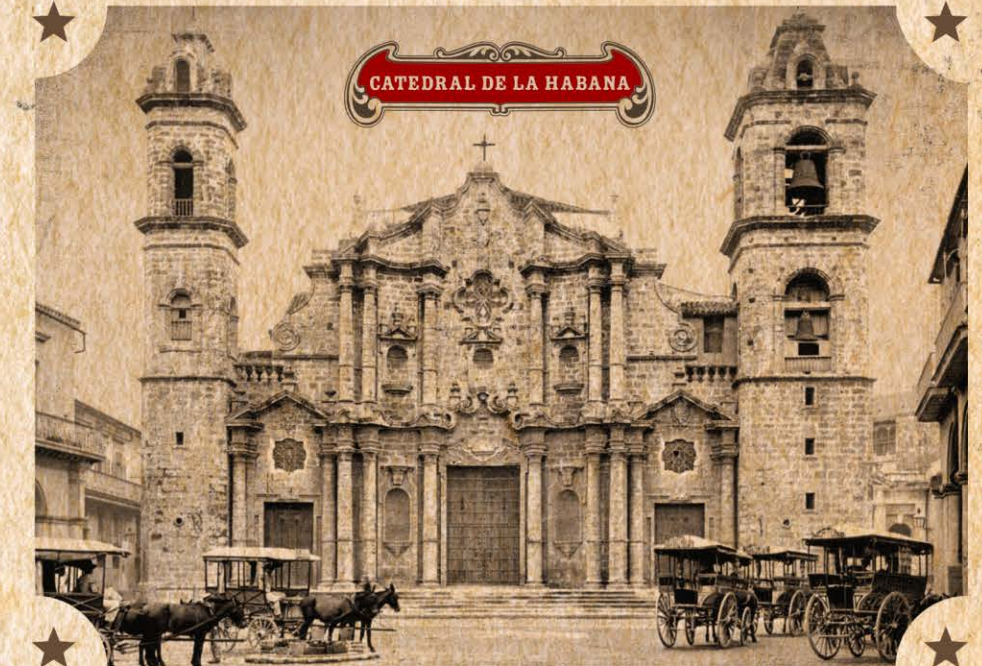
CATEDRAL DE LA HABANA