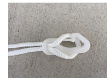
Loop part of the rope and thread through the bottom hole in the clip. Take the looped rope and wrap over the top of the clip.