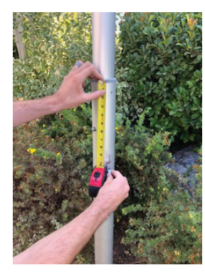
STEP SEVEN: Measure and mark the preferred location of your rope cleat. You can choose your desired height.