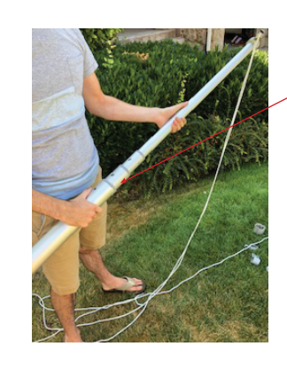
STEP SIX: Extend the first (bottom) section of the flagpole. (this is important so you don't drill through multiple sections)