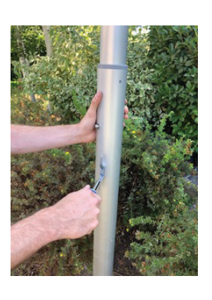
STEP NINE: Install cleat

Note: Once your cleat is installed it may inhibit the bottom section of the pole from completely retracting. You may need to remove the cleat to retract the entire pole.