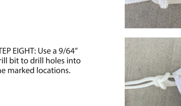
STEP ELEVEN Connect the 2 rope ends and raise your