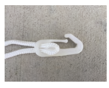
STEP TEN: Attach flag clips.