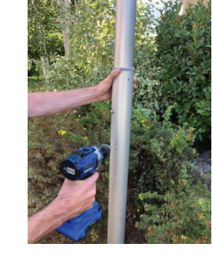
STEP EIGHT: Use a 9/64" drill bit to drill holes into the marked locations.