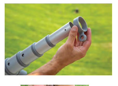
STEP THREE: Remove the flag rings from the pole.