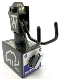
Mammoth 360 TIG Hooks

There's a Threaded Port at the rear of the MAMMOTH neck to facilitate the Safety Lanyard