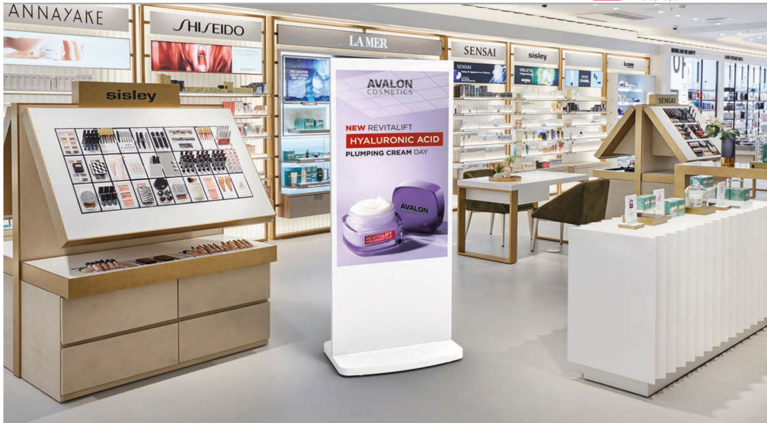
Show-stopping digital advertising totems with giant tablet styling