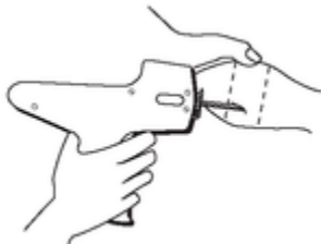
Fig. 2 - Rear View of the Bovine Ear Showing the Site for Insertion of the Implanter Needle.

After appropriately restraining the animal to allow access to the ear, cleanse the skin at the implant needle puncture site. It is subcutaneous between the skin and cartilage on the back side of the ear and below the midline of the ear. The implant must not be placed closer to the head than the edge of the cartilage ring farthest from the head. The location of insertion of the needle is a point toward the tip of the ear and at least a needle length away from the intended deposition site. Care should be taken to avoid injuring the major blood vessels or cartilage of the ear.