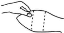
Fig. 1 - Ear of Bovine Ready for Implantation

With the animal suitably restrained, the skin on the outer surface of the ear should be cleaned. The implant is then administered by the method shown in the diagram below.