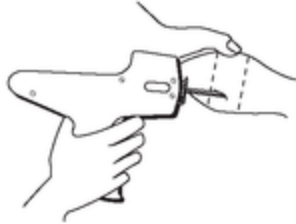
Fig. 2 - Rear View of the Bovine Ear Showing the Site for Insertion of the Implanter Needle.