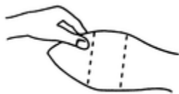
Fig. 1 - Ear of Bovine Ready for Implantation

With the animal suitably restrained, the skin on the outer surface of the ear should be cleaned. The implant is then administered by the method shown in the diagram below.