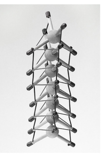
Tetrahedral Vertebral Spine