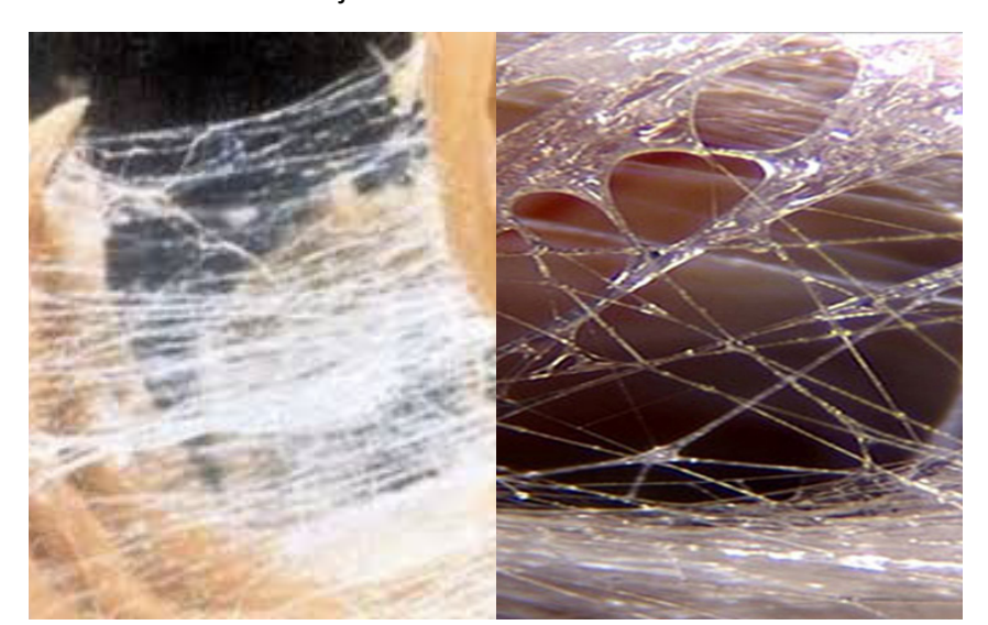
LIVE FASCIA: ©Jean-Glade Guimberteau

Fascia is a type of cobweb-like body tissue made from collagen, elastin and reticulin that makes up, organizes and holds the body together. There are five types of fascia tissue located everywhere inside the body, from superficial (towards the skin's surface) to deep (stretching around the organs and spine).