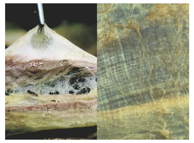
Left: Healthy Fascia | Right: Ossified Fascia

There is an increased interest and study of fascia and its systemic relationship to the body and our health.