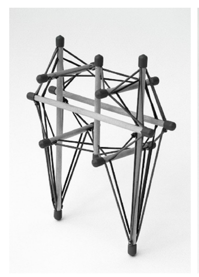
Double Tensioned Pelvis

There is a conflict between the solid and fluid body perspectives when it comes to body care. Treating the body as a solid is problematic and actually damages fascia and the CTS. Unfortunately, you're probably damaging fascia without even knowing it because of modern lifestyles and most of our fitness and even therapeutic modalities practices use the solid mechanical model. Take a look at a side by side of how solid and fluid mechanic principles differ when it comes to fascia.