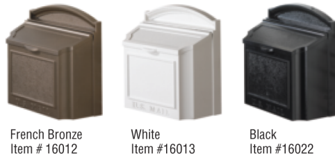
French Bronze Item # 16012