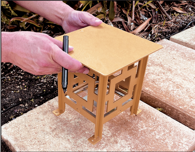
Locate where you want to install your Lights.