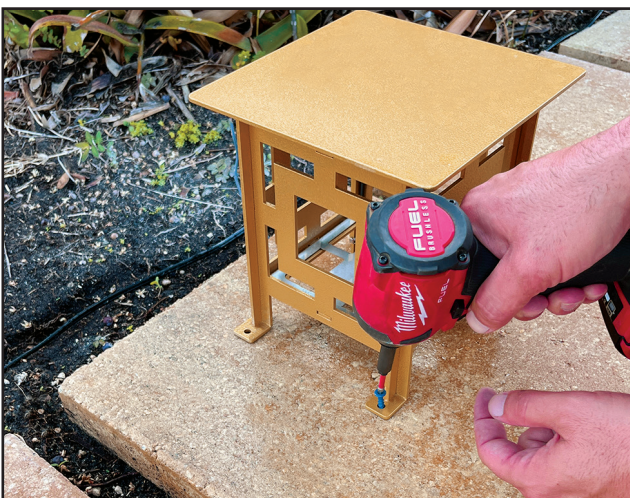
Attach to Deck, depending on your surface, wood, concrete, pavers etc. Any Hardware Store can direct you to the proper fastener type.