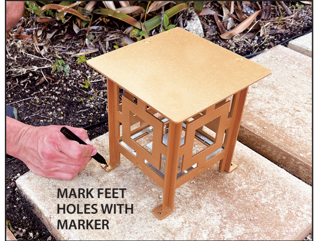
Mark feet holes with marker, don't forget to mark the hole for the low voltage wire to connect to the Lamp.