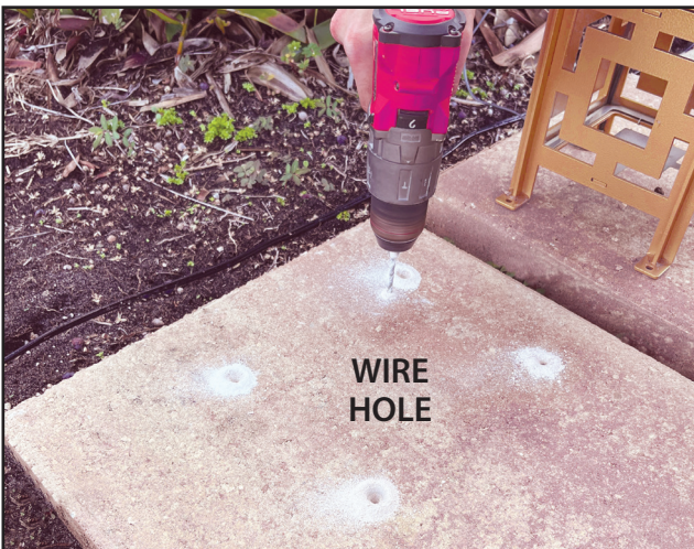
Drill 4 holes in the Deck for the feet attachment and one for landscape connection wire.