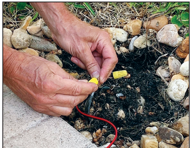
Attach the 2 wires from the Radiant Light to your new, or existing 12 to 15 volt, low voltage light system wire.