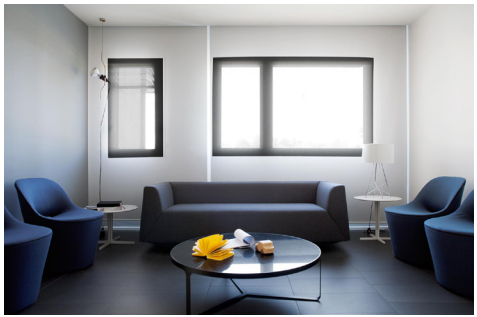
COB (Meda, Italy)