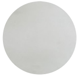
T123 Grey Cement