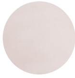
T124 Pink Cement