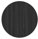
T122 Anthracite Grey