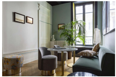
Manifesta by Claude Cartier Decoration (Lyon, France)