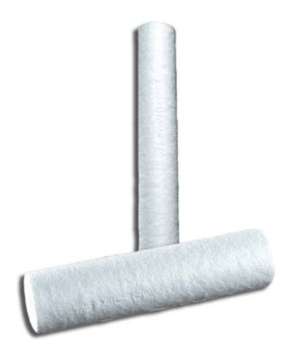
Figure 1: Purtrex Depth Cartridge Filters