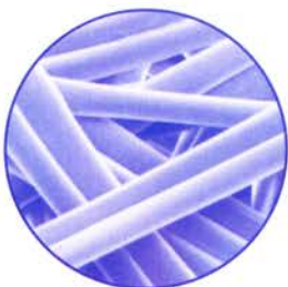
100% polypropylene continuous filament fiber