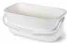
Item A0046 (Available in case of 3)

We've scoured the planet looking for the 'World's Best' graffiti removal applicators, suitable for applying our products. They're long lasting, chemically resistant and guaranteed to make your job a whole lot easier.