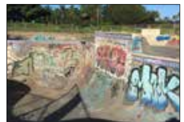
Can be used to protect horizontal surfaces, such as skate parks