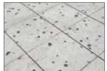
Makes cleaning gum easy, and prevents gum ghosts

4G Surface Guard makes porous walls or floors easy to clean without altering appearance.