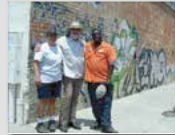
Demonstrations, Expert Training & Advice.