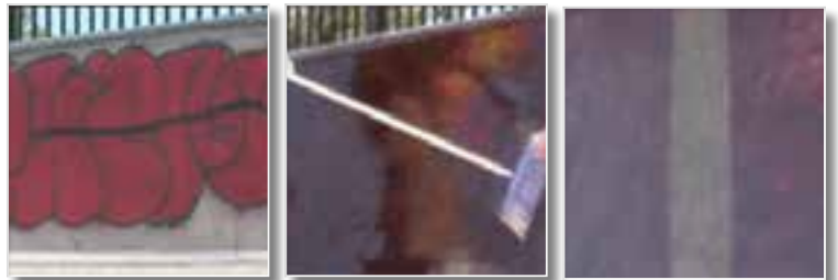
Feltpen Fadeout removes red spraycan stains from virtually any building surfaces, after or during removal using BBSM Graffiti Remover.