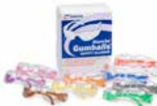
Item A0100 (Available in case of 10 & mastercase of 100)

Fits either hand, and is extra long and durable (8mm thick). Available in size XL only, which works best for everyone.