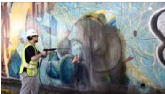
Cleaning graffiti after using Muralshield in conjunction with World's Best Graffiti Coating