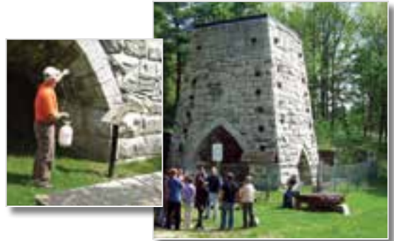
Friends of Beckley Furnace apply World's Best Graffiti Coating.

World's Best Graffiti Coating works in conjunction with MuralShield by offering long lasting protection for murals and artworks.