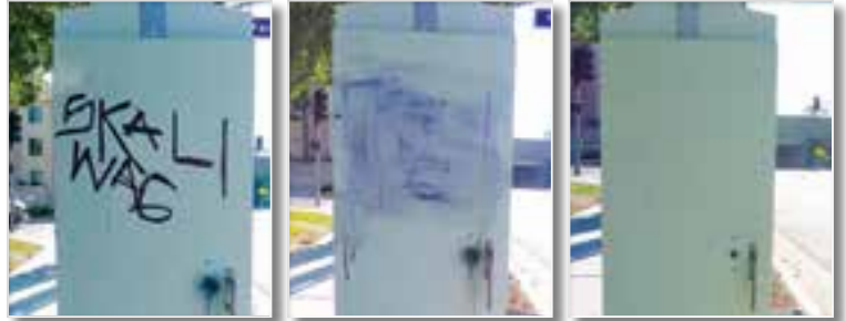
Removes ink stains from coated and painted surfaces.

Alternative uses include removal of eggs on signs and 'dusties' (which are caused by taggers pushing in grease and grime into painted walls). Water down 20:1 for general building wash down and organic stain removal from plants/algae and mold.