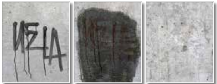
Removes ink stains from magic markers, leather dyes, boot polish etc. on porous surfaces such as concrete, stone, marble and terrazzo.