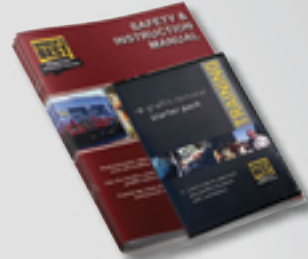
Training Materials & Manual included with every Starter Pack.