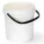
Item A0040 (Available in case of 12)

We love these handy buckets so much that we bring them in from Australia. Perfect for brooming up our removers on sidewalks, walls and concrete skate park bowls. Low profile allows for dragging along the ground. Square shape and compact design fits perfectly in the back of your truck.