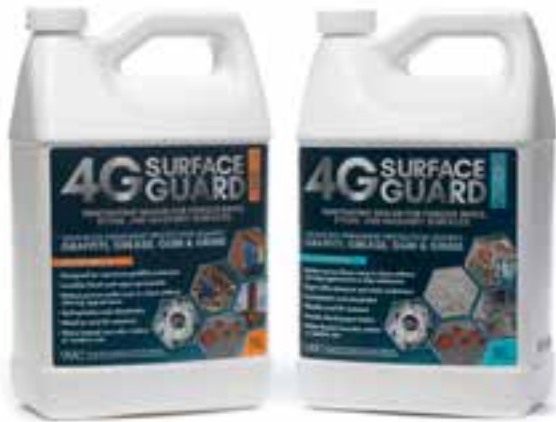
1 Gallon Walls: Item WB0152

Typical coverage is 160-240 sq ft per gallon.