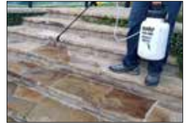
Ideal for natural stone that appears wet with water