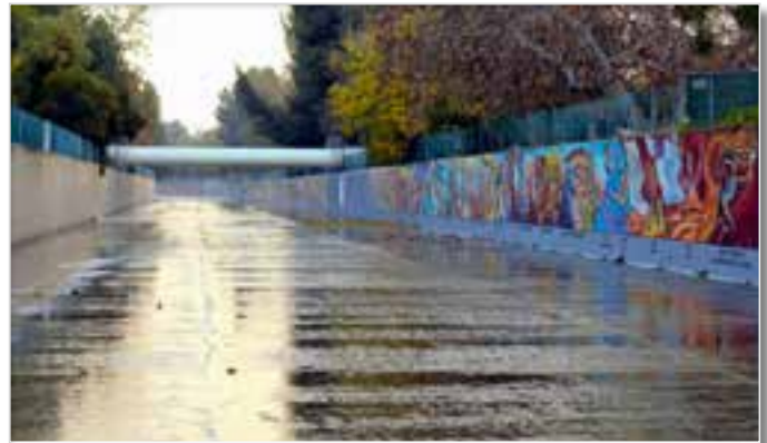
'The Great Wall of Los Angeles' © Judy Baca (the world's longest mural)