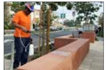
Used in high value, high traffic locations