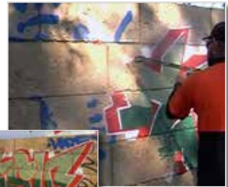
After applying the Coating, it is easy to remove graffiti with hot water alone, or with just one quick application of our removers.