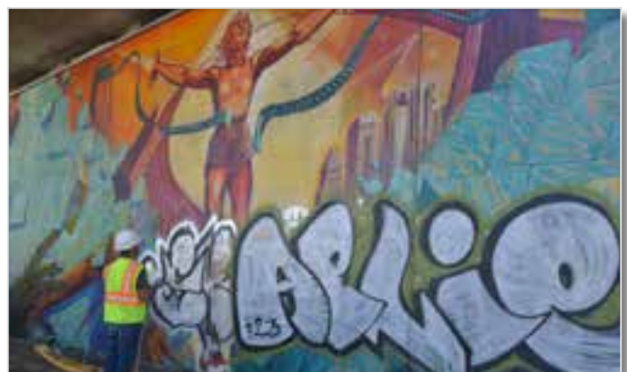
'Hitting the Wall' © Judy Baca (Los Angeles 110 Freeway)