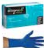
Item A0140 (Available in case of 50 & mastercase of 500)

Ideal for all brush-on / wipe-off applications or for flood coating our removers onto walls before pressure washing.