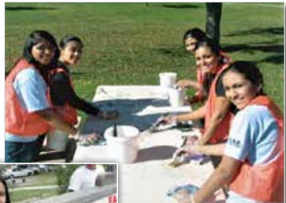
Community clean-up event Riverside, CA

(Available in cases of 12. Custom Labeling available upon request).