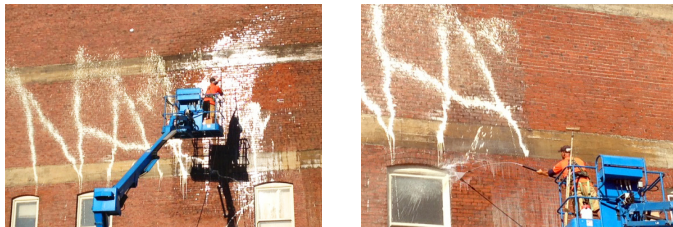
Removes paint spray from super soakers & fire extinguishers.

Alternative uses include the removal of adhesive from carpet and tile floors and the removal of sealants and graffiti coatings which have deteriorated with age.