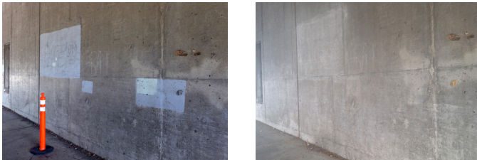
Removes unsightly graffiti paintovers.

Apply VANISH and leave on as long as needed. Scrape up as much dissolved glue as possible before pressure washing with hot water.