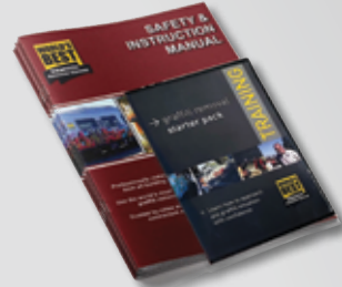
Training Materials & Manual included with every Starter Pack.