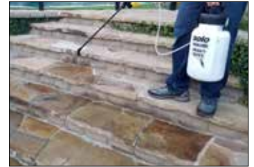
Ideal for natural stone that appears wet with water