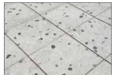
Makes cleaning gum easy, and prevents gum ghosts

4G Surface Guard makes porous walls or floors easy to clean without altering appearance.