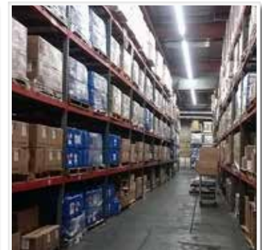
Urban Restoration Group US Inc Factory & Warehouse, Los Angeles CA