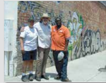
Demonstrations, Expert Training & Advice.