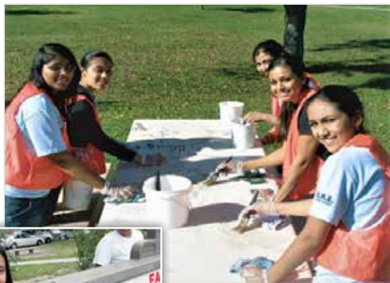
Community clean-up event Riverside, CA

(Available in cases of 12. Custom Labeling available upon request).