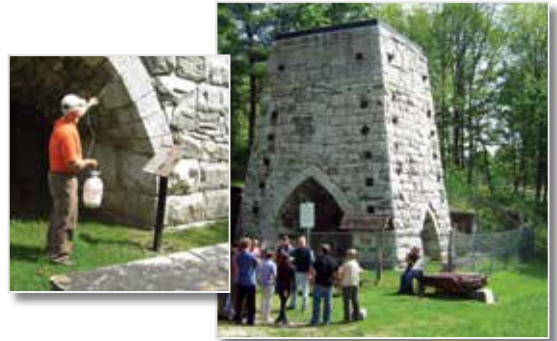
Friends of Beckley Furnace apply World's Best Graffiti Coating.

World's Best Graffiti Coating works in conjunction with MuralShield by offering long lasting protection for murals and artworks.