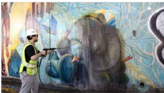
Cleaning graffiti after using Muralshield in conjunction with World's Best Graffiti Coating