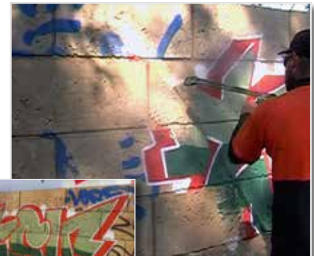
After applying the Coating, it is easy to remove graffiti with hot water alone, or with just one quick application of our removers.