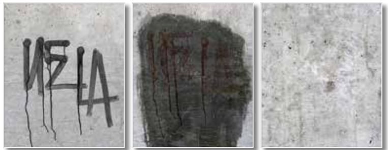
Removes ink stains from magic markers, leather dyes, boot polish etc. on porous surfaces such as concrete, stone, marble and terrazzo.