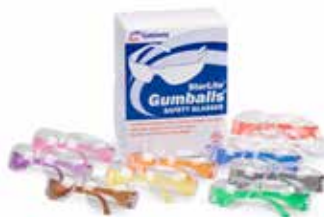
Item A0100 (Available in case of 10 & mastercase of 100)