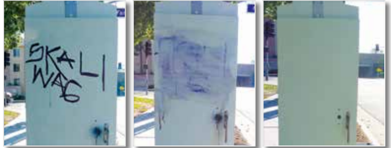
Removes ink stains from coated and painted surfaces.

Alternative uses include removal of eggs on signs and 'dusties' (which are caused by taggers pushing in grease and grime into painted walls). Water down 20:1 for general building wash down and organic stain removal from plants/algae and mold.