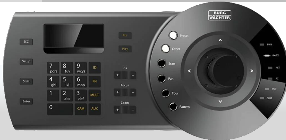
Abbildung unverbindlich Image as reference only

Multifunktionales Keyboard Multi-function keyboard