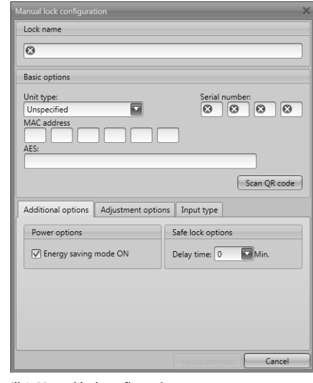
III.1: Manual lock configuration

• Under lock management, add a new lock to the setting menu. The screen window for lock configuration appears.