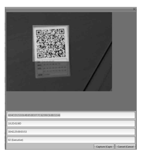
III.2: OR code scan

• Click Capture so that the data can be accepted and transferred into the system.