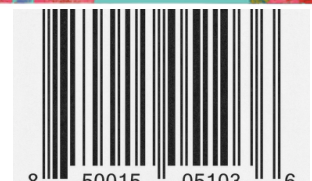
EDIBLE FLOWER PETALS A blend of colorful, dried edible petals SKU# 51036