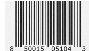
FINISHING SUGAR Orange Blossom SKU# 51043