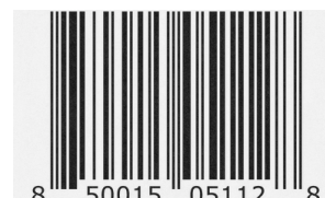
GARNISHING SALT Sea salt with herbs & edible flowers SKU# 51128