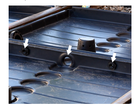
Flow-through channels — All Pans are connected "end-to-end" with bulkhead fittings, and a 3-inch diameter flow-through channel, allowing spills to quickly travel from one Pan to the next.