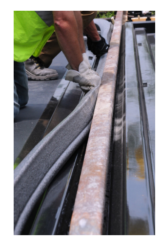
Optional rail side gaskets prevent leaking between rails and Track Pans.