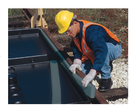
Closed-cell, polyethylene gaskets are installed to provide a seal between the Pans and rails. (Gaskets are provided.)