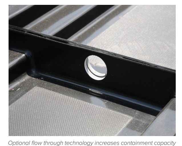
for larger spills while minimizing cleanup of smaller spills.