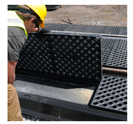
Optional polyethylene grating package available for safer foot traffic.