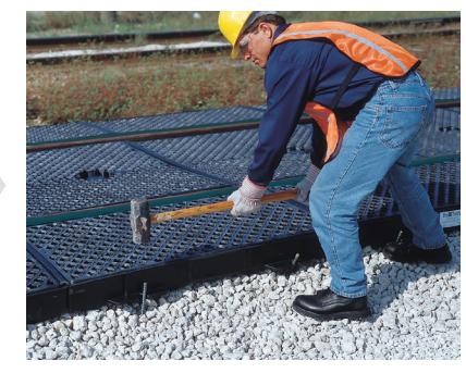
Side Pans are secured in place with 24" rebar fasteners. Typical installs require two pieces of rebar per Side Pan.