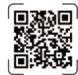
Govee Home App

For FAQs and more information, please visit: www.govee.com