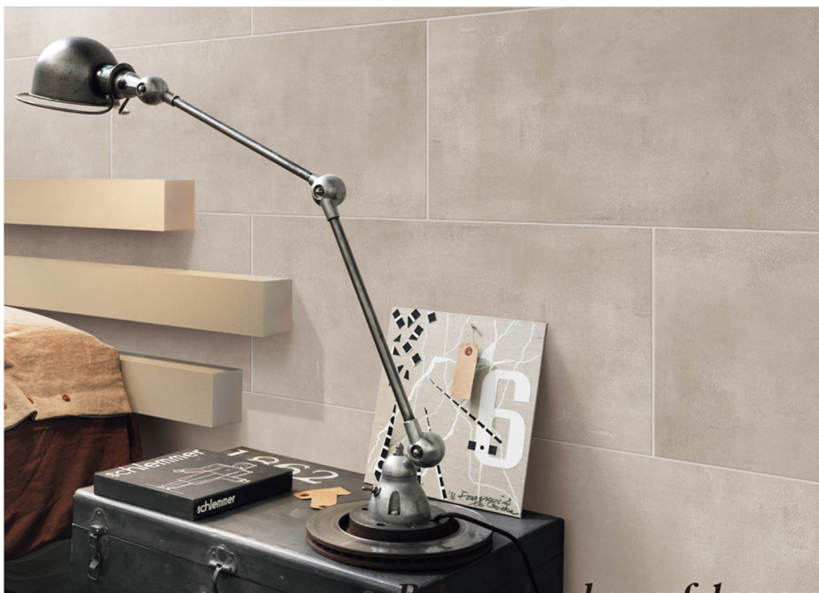
Balanced and peaceful spaces