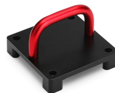
Castle Nut wrench