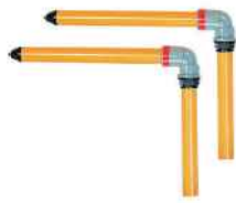
RAA-1 Right Angle Adaptors