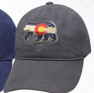
BEAR GRAY COLORADO #SVUSBCO-GRY

6 PANEL PIGMENT DYED CAP - SUBLIMATION PRINT ON TEXTURED 3D EMBROIDERY - RELAXED FRONT - COTTON SWEATBAND - SEWN EYELETS - SLIGHTLY EXTENDED PRECURVED BILL - MESH BACK - SNAPBACK CLOSURE