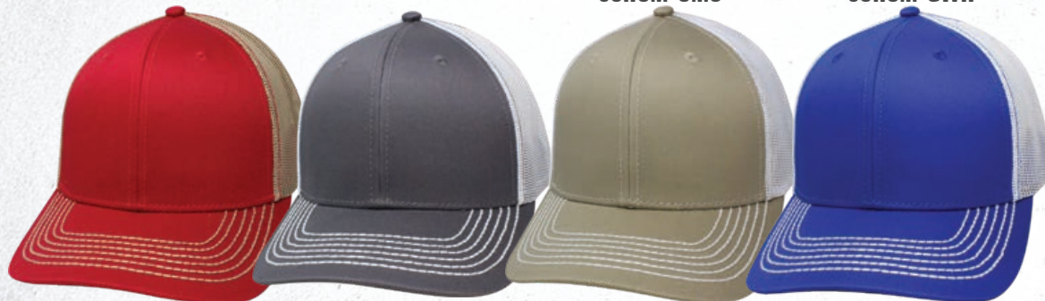
RED / KHAKI #65RCM-RKH