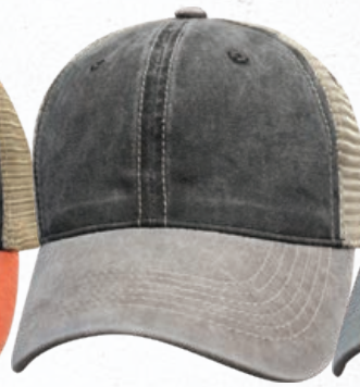
CHARCOAL / GRAY / KHAKI #82LPD-CGK