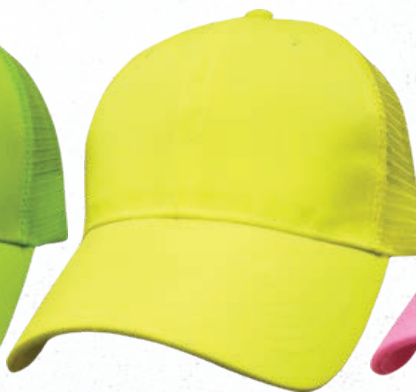
NEON YELLOW #95SUN-NYL