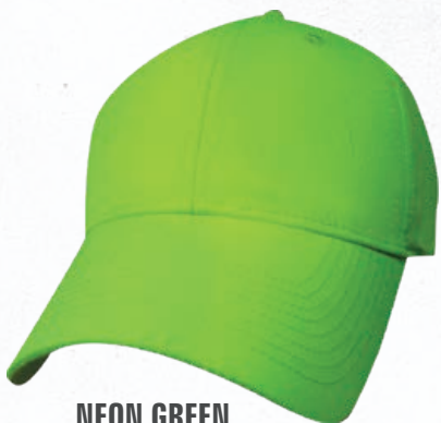
NEON GREEN #95NEO-NGR

6 PANEL NEON MICROFIBER CAP • LOW CROWN • REINFORCED FRONT • SELF FABRIC SWEATBAND • SEWN EYELETS • PRECURVED BILL • HOOK & LOOP CLOSURE