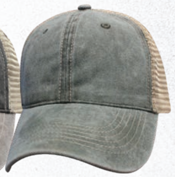
GREEN / KHAKI #82LPD-GNK