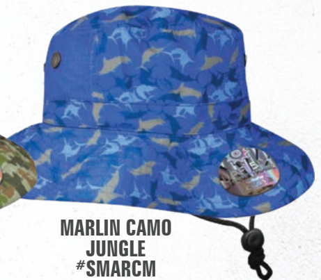
MARLIN CAMO JUNGLE #SMARCM