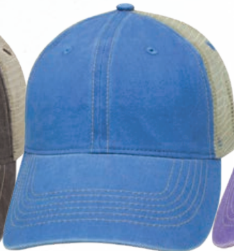
PERIWINKLE / KHAKI #82LPD-PWK