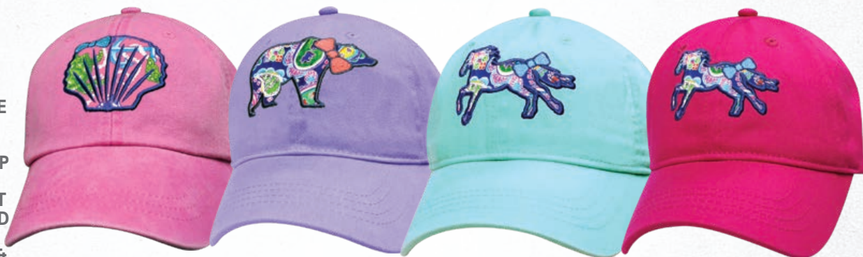
NAUTICAL SHELL / RASPBERRY #SDCNSS-RAS

6 PANEL PASTEL SOFT WASHED CAP • EXCLUSIVE PRINTED PATTERN APPLIQUE • EMBROIDER YOUR CUSTOM NAMEDROP BELOW APPLIQUE • LOW CROWN • RELAXED FRONT • SELF FABRIC SWEATBAND • SEWN EYELETS • PRECURVED BILL • HOOK & LOOP CLOSURE