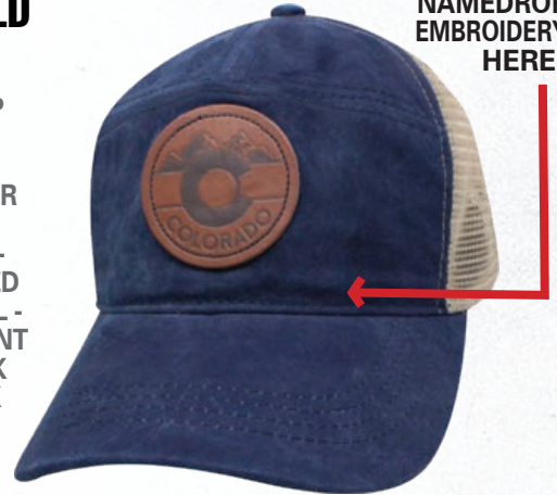
NAVY / KHAKI / COLORADO #SROTNCO

7 PANEL CAP - PRINTED/EMBOSSED FAUX LEATHER APPLIQUE ON CROWN - PIGMENT DYED CROWN & BILL - RELAXED FRONT - MESH BACK - SNAPBACK CLOSURE