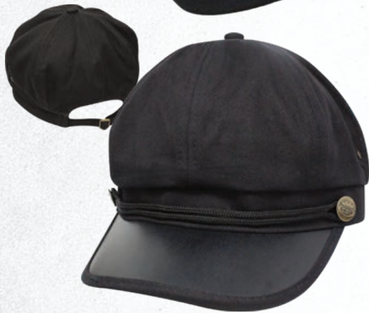
WILD ONE BLANK #33WLD-BLK

6 PANEL CAP - CUSTOM DEEP FIT CROWN - REINFORCED FRONT - SELF FABRIC SWEATBAND - SEWN EYELETS - SLIGHTLY CURVED BILL - SNAPBACK CLOSURE