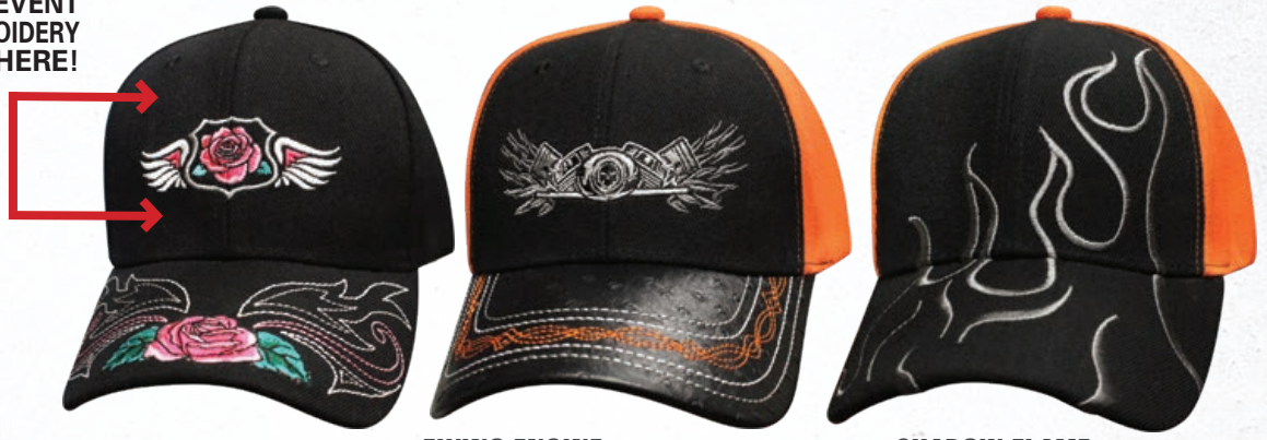
WESTERN ROSE WING #SBBWRW