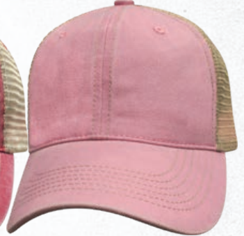
LIGHT PINK / KHAKI #82LPD-PNK