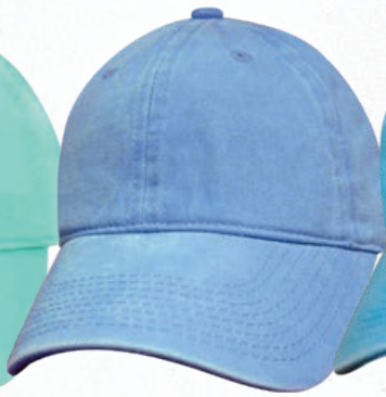
LITTLE BOY BLUE #83RSW-LBB