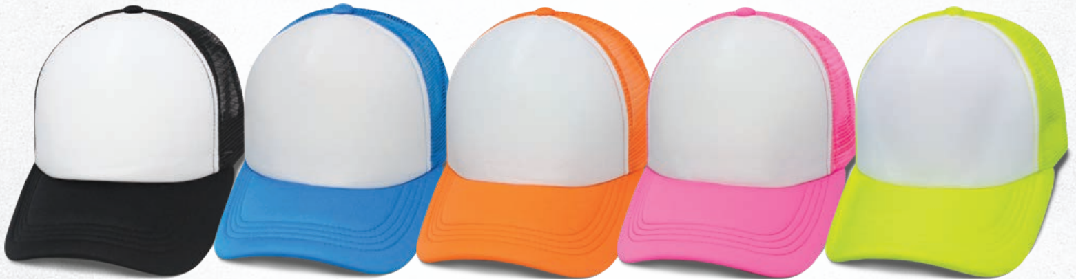
WHITE / BLACK #57SSW-WHB

5 PANEL CAP • 3" HIGH CROWN • POLYFOAM WHITE FRONT • REINFORCED FRONT • COTTON SWEATBAND • PRECURVED BILL • NEON MESH BACK • SNAPBACK CLOSURE