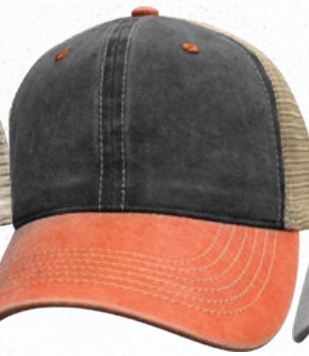
CHARCOAL / ORANGE / KHAKI #82LPD-COK