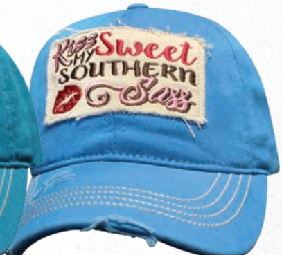
SWEET SOUTHERN SASS TURQUOISE #SKMSSS-TUR