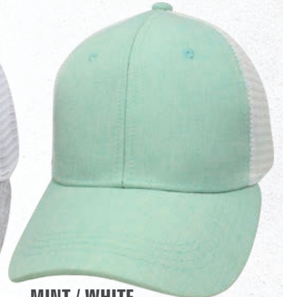
MINT / WHITE #68RCM-MIN