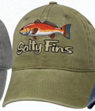
KHAKI / REDFISH #SBWVKH