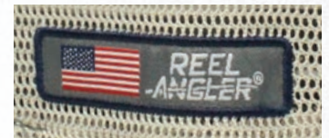
CLOSEUP OF SIDE WOVEN LABEL

6 PANEL PIGMENT DYED CAP - SUBLIMATION PRINT ON TEXTURED 3D EMBROIDERY - WOVEN APPLIQUE ON SIDE - RELAXED FRONT - COTTON SWEATBAND - SLIGHTLY EXTENDED PRECURVED BILL - MESH BACK - SNAPBACK CLOSURE