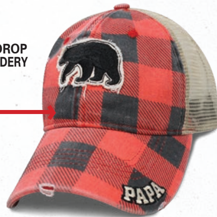
VINTAGE PLAID PAPA BEAR #SHSTPP

6 PANEL STONE WASHED BUFFALO PLAID CAP - EMBROIDERY ON DISTRESSED APPLIQUE ON CROWN - DISTRESSING ON CAP - RELAXED FRONT - MESH BACK - SNAPBACK CLOSURE