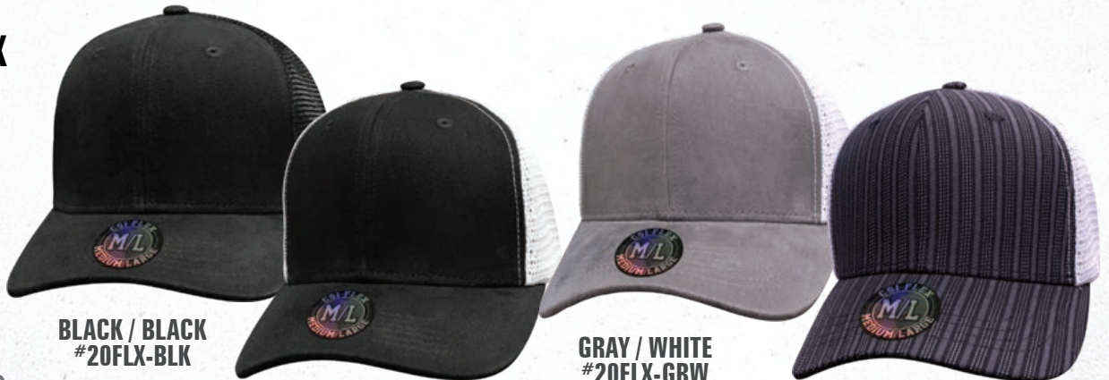
BLACK / BLACK #20FLX-BLK

6 PANEL CAP • COTTON FRONT • CUSTOM DEEP FIT CROWN • REINFORCED FRONT • STRETCH SWEATBAND • SEWN EYELETS • SLIGHTLY CURVED BILL • PERFORMANCE MESH BACK • FLEXIBLE BACK FOR EXTRA COMFORT & EXTENDED WEAR • HOLOGRAPHIC STICKER ON BILL • PRE-ASSORTED TO INCLUDE 6 M/L AND 6 L/XL PER DOZEN.