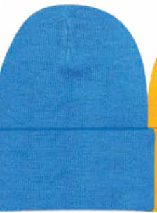
SKY BLUE #42CUF-SKB