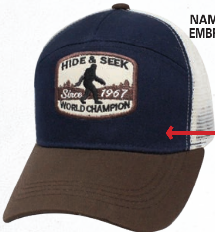
SASQUATCH CHAMP #SSQCHP

7 PANEL CAP - EMBROIDERY ON FABRIC APPLIQUE ON CROWN - REINFORCED FRONT - CUSTOM DEEP FIT CROWN - SLIGHTLY CURVED BILL - MESH BACK - SNAPBACK CLOSURE