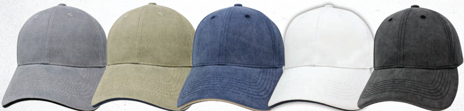
BLACK / GRAY #88LAM-BLG

6 PANEL PIGMENT DYED CAP - LOW CROWN - REINFORCED FRONT - COTTON SWEATBAND - SEWN EYELETS - PRECURVED SANDWICH BILL - HOOK & LOOP CLOSURE