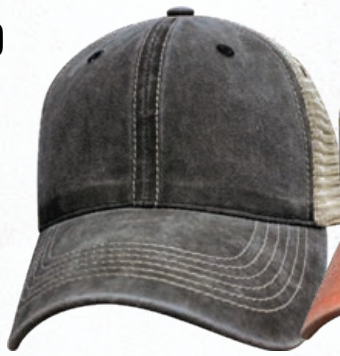
CHARCOAL / KHAKI #82LPD-CHK

6 PANEL PIGMENT DYED CAP • RELAXED FRONT • POPLIN SWEATBAND • SEWN EYELETS • SLIGHTLY EXTENDED BILL • PRECURVED BILL • MESH BACK • HOOK & LOOP CLOSURE