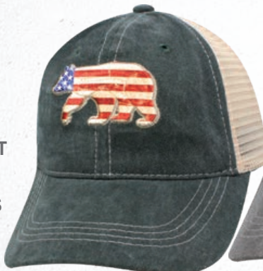
BEAR / DARK FOREST / KHAKI #SVUSAB-DFS

6 PANEL PIGMENT DYED CAP - SUBLIMATION PRINT ON TEXTURED 3D EMBROIDERY - RELAXED FRONT - COTTON SWEATBAND - SEWN EYELETS - SLIGHTLY EXTENDED PRECURVED BILL - MESH BACK - SNAPBACK CLOSURE