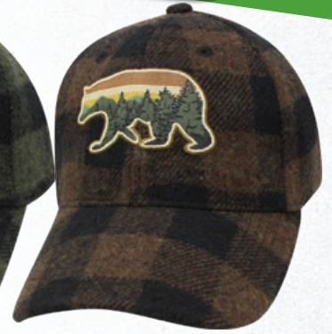
BEAR OLIVE / BLACK PLAID #SSICBR-OLB