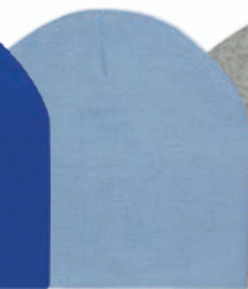
COL. BLUE #44KNT-COL