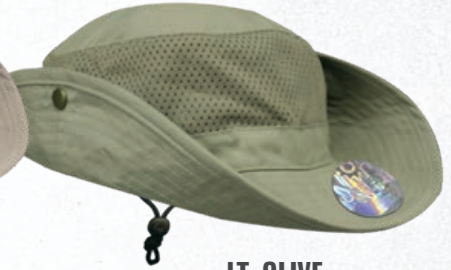
LT. OLIVE #99MIM-LOL