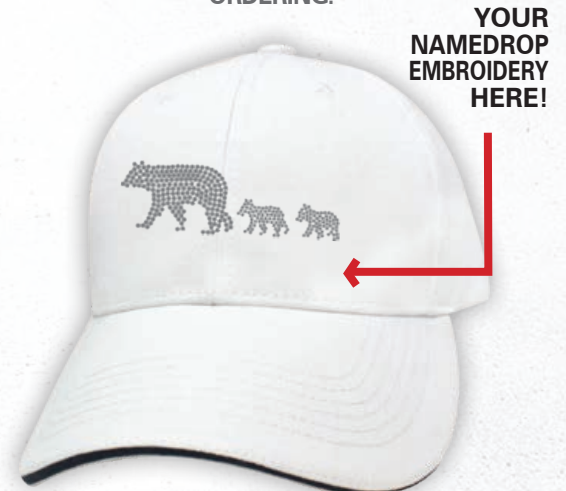
BLING BEAR FAMILY #BBFAML

PLEASE SPECIFY CAP & COLOR TO YOUR SALES REPRESENTATIVE WHEN ORDERING.