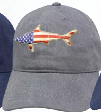
SHARK / GRAY #SVUSASH