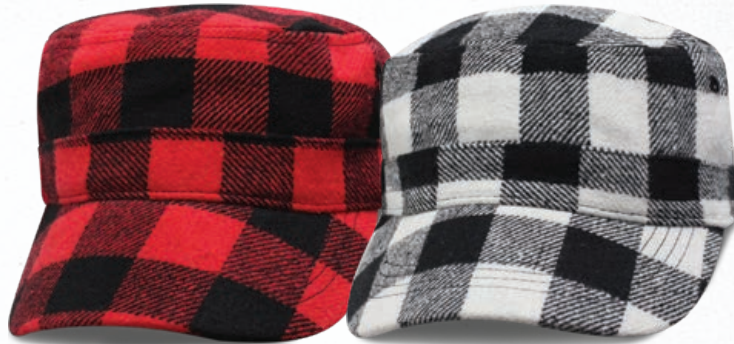
BUFFALO PLAID FATIGUE BLANK #68PLD-FBP

3 PANEL BUFFALO PLAID FATIGUE CAP • LOW CROWN • COTTON SWEATBAND • SEWN EYELETS • BUFFALO PLAID HOOK & LOOP CLOSURE