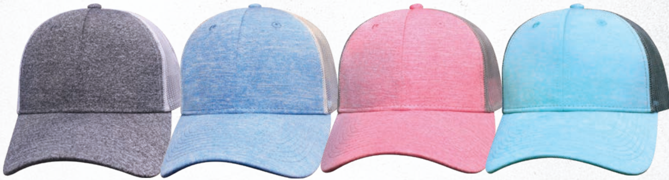
GRAY / WHITE #95HEA-GRW

6 PANEL CAP • HEATHER CROWN & BILL • LOW CROWN - REINFORCED FRONT • COTTON SWEATBAND • SEWN EYELETS • PRECURVED BILL • MESH BACK • SNAPBACK CLOSURE