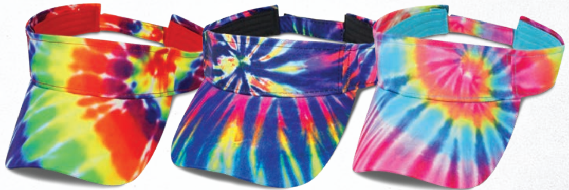
BRIGHT TIE DYE #90TIE-BRI

ALL OVER SUBLIMATION PRINT POLYESTER VISOR • COTTON SWEATBAND • PRECURVED BILL • HOOK & LOOP CLOSURE