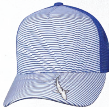
STRIPY WAVES #67SWA-ROY

5 PANEL CAP • SUBLIMATION PRINTED FRONT • REINFORCED FRONT • MESH BACK • SNAPBACK CLOSURE