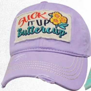
BUTTERCUP WISTERIA #SBKBTR-WIS

6 PANEL SOFT WASHED CAP • DISTRESSED APPLIQUE ON CROWN WITH EMBROIDERY • COTTON SWEATBAND • SEWN EYELETS ON BACK • 3PLY STITCHING & DISTRESSING ON PRECURVED BILL • BRASS BUCKLE CLOSURE