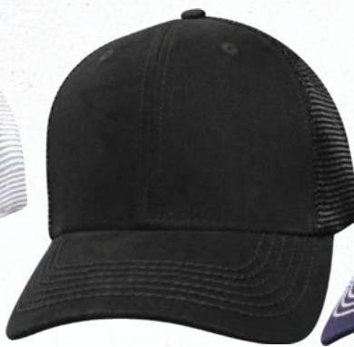
BLACK / BLACK #65RCT-BLK