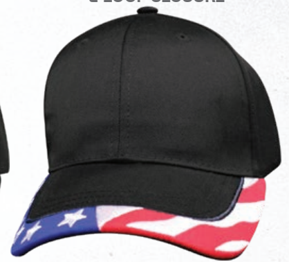
PARTIAL FLAG BILL / BLACK #SPATBB