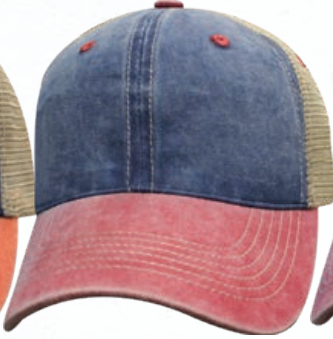
NAVY / RED / KHAKI #82LPD-NRK