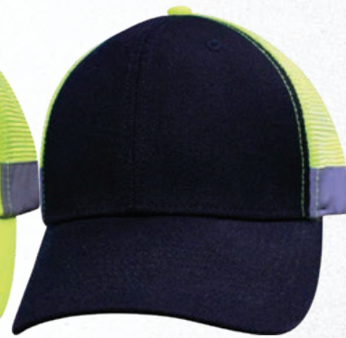
SAFETY / BLACK* #65RCT-BHV