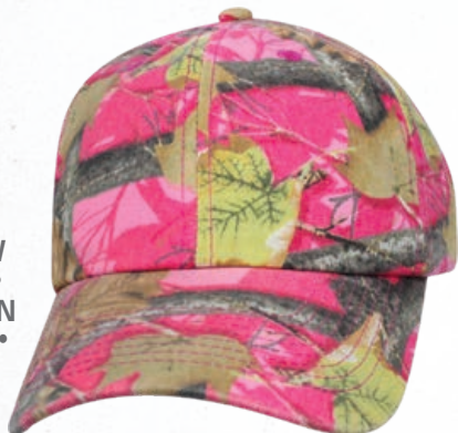
PINK CAMO† #6LCAM

6 PANEL COTTON CAP • LOW CROWN • RELAXED FRONT • COTTON SWEATBAND • SEWN EYELETS • PRECURVED BILL • HOOK & LOOP CLOSURE