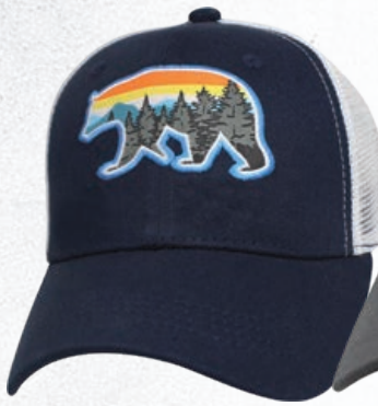
NAVY / WHITE / BEAR #SSUNIC-NWH

6 PANEL CAP • LOW CROWN • WOVEN APPLIQUE ON CROWN • REINFORCED FRONT • COTTON SWEATBAND • SEWN EYELETS • PRECURVED BILL • MESH BACK • SNAPBACK CLOSURE