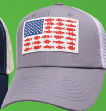
GRAY / WHITE FRESHWATER #SICFFW-GWH