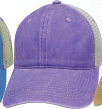
PURPLE / SILVER #82LPD-PSI