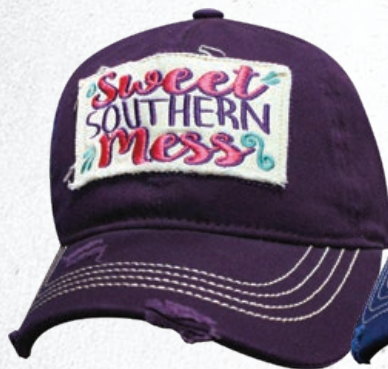
SWEET SOUTHERN MESS PURPLE #SSSOMS-PUR