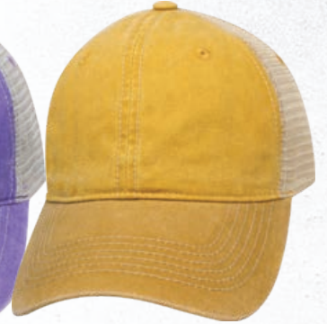
MUSTARD / CAMEL / KHAKI #82LPD-MCK