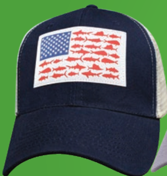
NAVY / WHITE SALTWATER #SICFSW-NWH