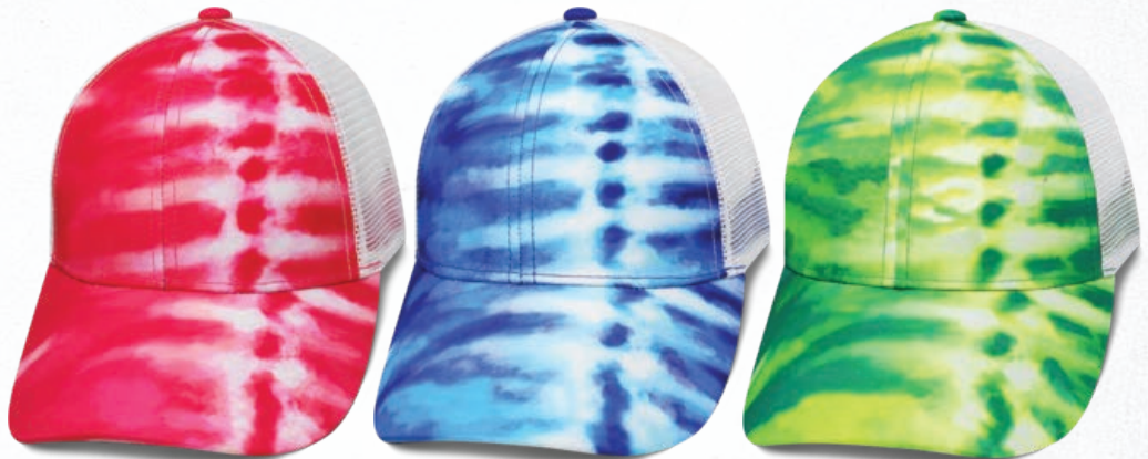
UP DOWN MAGENTA TIE DYE / WHITE #95TIEM-MAG

6 PANEL CAP - SUBLIMATION PRINTED CROWN & BILL - LOW CROWN - REINFORCED FRONT - COTTON SWEATBAND - PRECURVED BILL - MESH BACK - SNAPBACK CLOSURE