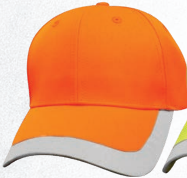
SAFETY ORANGE WITH REFLECTIVE #68SAF-SAF0

6 PANEL COTTON CAP - LOW CROWN - REINFORCED FRONT - EMBROIDERY ON BILL - SELF FABRIC SWEATBAND - SEWN EYELETS - PRECURVED BILL - HOOK & LOOP CLOSURE