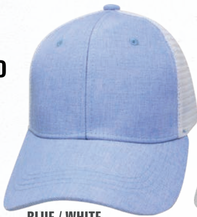
BLUE / WHITE #68RCM-BLU

6 PANEL TWEED POLYESTER CAP - CUSTOM DEEP FIT CROWN - REINFORCED FRONT - SELF FABRIC SWEATBAND - SEWN EYELETS - SLIGHTLY CURVED BILL - MESH BACK - SNAPBACK CLOSURE