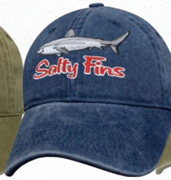
NAVY / SHARK #SBWVNA