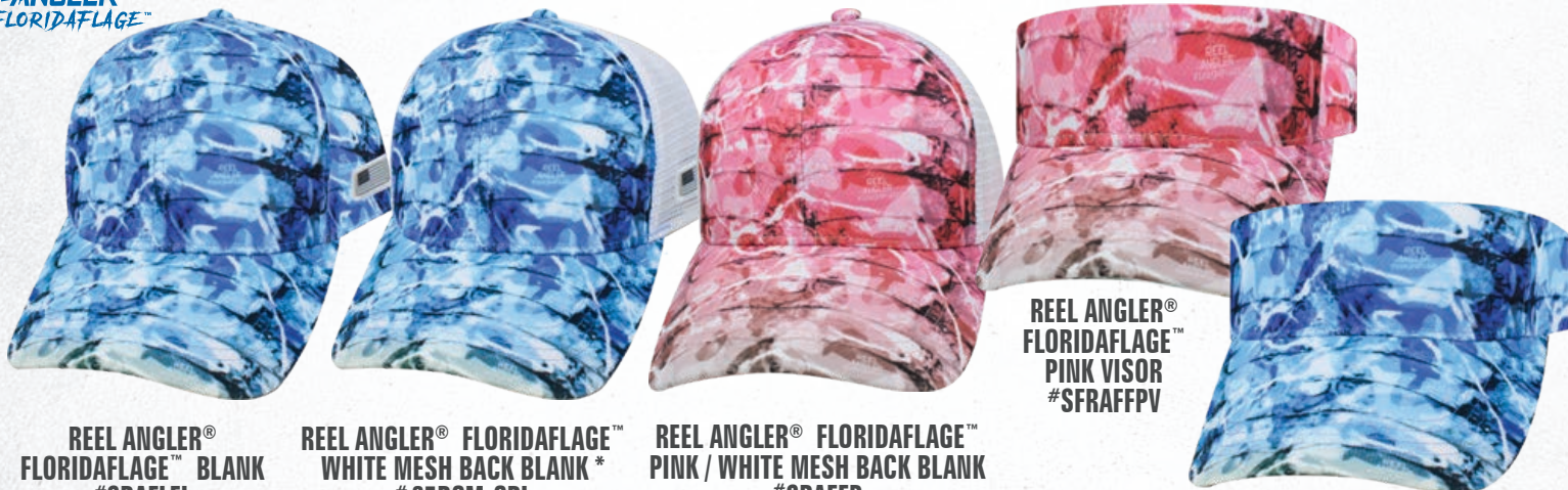
REEL ANGLER® FLORIDAFLAGE™ BLANK #SRAFFL