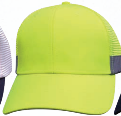
HI-VIS / HI-VIS MESH* #65RCT-HVY