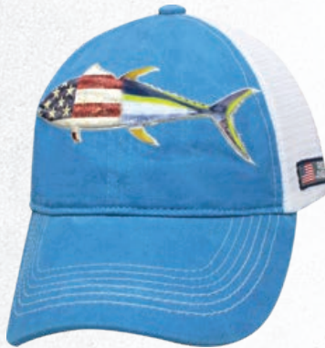
TUNA / CERULEAN BLUE / WHITE #SVUSTUN