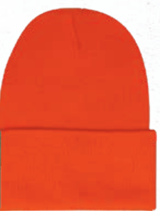
FLAME ORANGE #42CUF-FLO