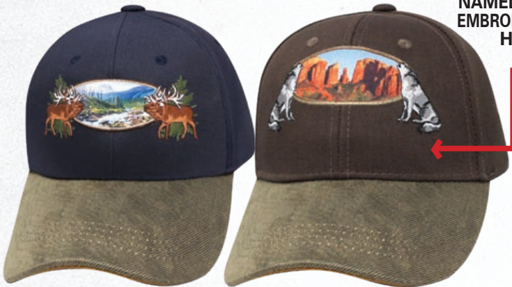
NAVY / OILSKIN BROWN COLORADO #SPICNCO

6 PANEL CAP - SUBLIMATION PRINTED APPLIQUE WITH EMBROIDERY ON CROWN - OILSKIN BILL - LOW CROWN - REINFORCED FRONT - COTTON SWEATBAND - SEWN EYELETS - PRECURVED BILL - HOOK & LOOP CLOSURE