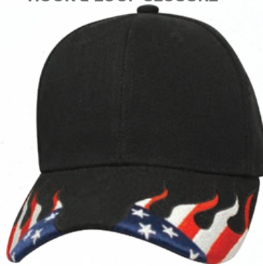
USA FLAMES #75FIR-USA