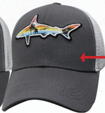
GRAY / WHITE / SHARK #SSICSH-GRY