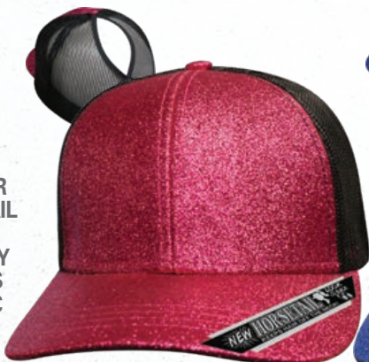
HOT PINK #55SPR-HPK

6 PANEL CAP • KEEP YOUR HAIR OFF YOUR NECK WITH HORSETAIL OPENING • SPARKLE FRONT • REINFORCED FRONT • SLIGHTLY CURVED BILL • SEWN EYELETS • MESH BACK • HOLOGRAPHIC STICKER ON BILL • SNAPBACK CLOSURE