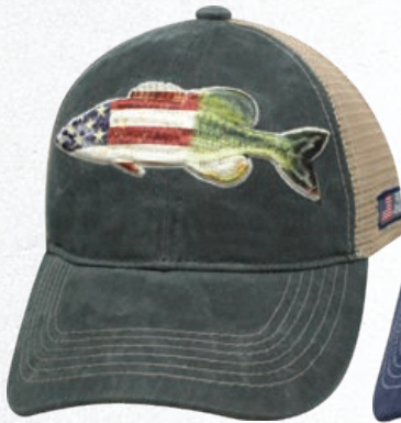
BASS / DARK FOREST / KHAKI #SVUSBAS