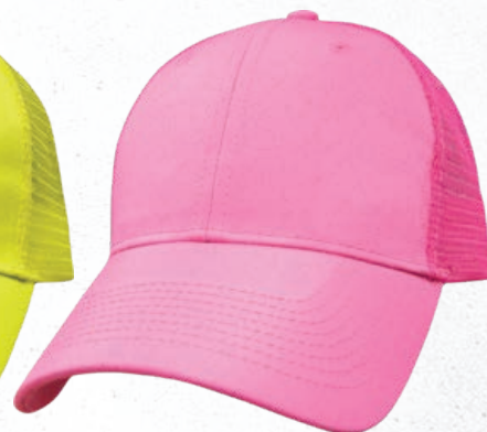
NEON PINK #95SUN-NPK

LAST CHANCE DEALS! GET THEM WHILE YOU CAN!