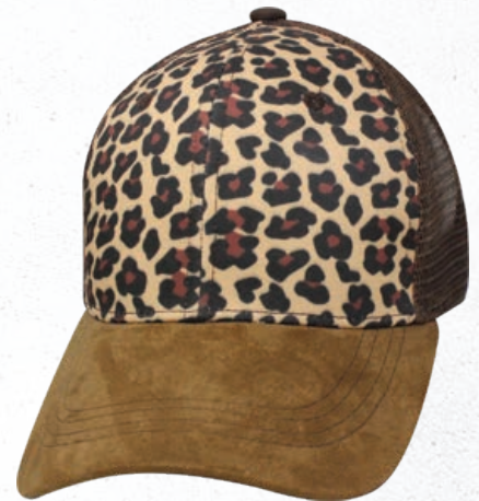
LEOPARD / TAN SUEDE BLANK #95LEO-BRM

6 PANEL CAP - SUBLIMATION PRINTED CROWN - FAUX SUEDE BILL - LOW CROWN - REINFORCED FRONT - COTTON SWEATBAND - SEWN EYELETS - PRECURVED BILL - MESH BACK - SNAPBACK CLOSURE