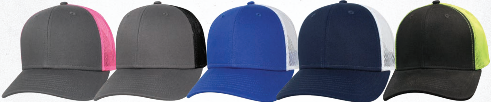
GRAY / PINK #35RCT-GRP