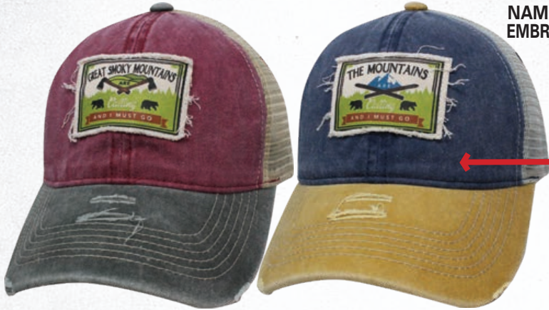
LIFE IS CALLING GREAT SMOKY MOUNTAINS #SLCGSMB

6 PANEL CAP - PIGMENT DYED CROWN & BILL - PRINT ON DISTRESSED APPLIQUE ON CROWN - RELAXED FRONT - DISTRESSING ON BILL - MESH BACK - HOOK & LOOP CLOSURE