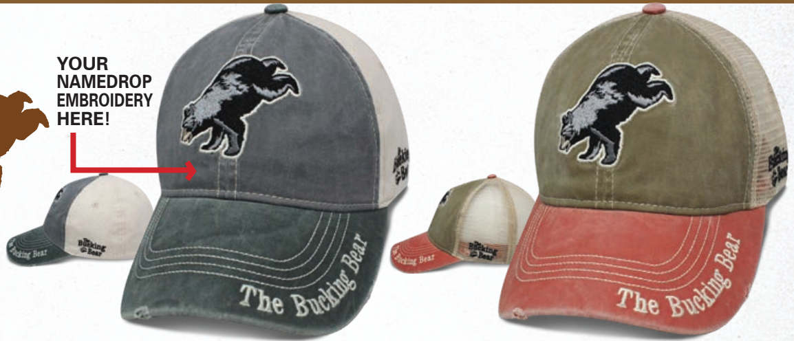
GRAY / GREEN / STONE #SBBBB-DGS