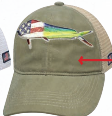
DOLPHIN / KHAKI / KHAKI #SVUSDOL