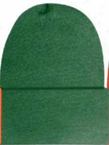
FOREST GREEN #42CUF-FST