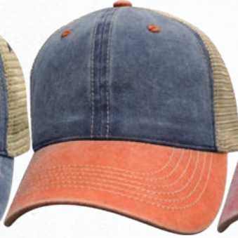
NAVY / ORANGE / KHAKI #82LPD-NOK