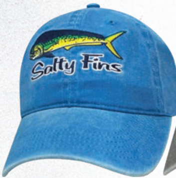
CERULEAN BLUE / DOLPHIN #SBWVCB