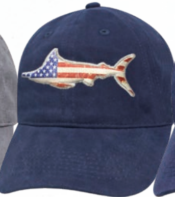
MARLIN / NAVY #SVUSASF