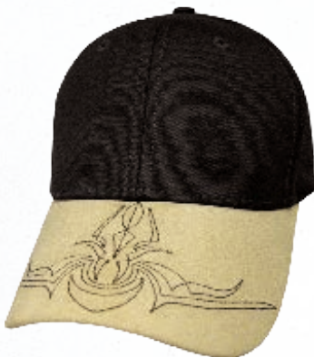
LT. BROWN / BLACK #74CBS-LBB

6 PANEL CAP • LOW CROWN • REINFORCED FRONT • FAUX SUEDE BILL WITH WESTERN BOOT STITCH DESIGN • COTTON SWEATBAND • SEWN EYELETS • PRECURVED BILL • HOOK & LOOP CLOSURE