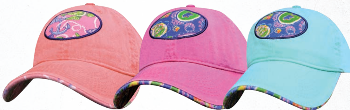
NAUTICAL / MELON #96DEN-MEL

6 PANEL PASTEL SOFT WASHED CAP • EXCLUSIVE PRINTED PATTERN APPLIQUE • EMBROIDER YOUR CUSTOM NAMEDROP BELOW APPLIQUE • EMBROIDER YOUR CHOSEN ICON ON APPLIQUE • LOW CROWN • RELAXED FRONT • FLIP BILL • SELF FABRIC SWEATBAND • SEWN EYELETS • PRECURVED BILL • HOOK & LOOP CLOSURE