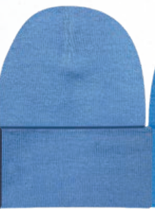
COL. BLUE #42CUF-COL