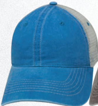
CERULEAN BLUE / GRAY #82LPD-CGR