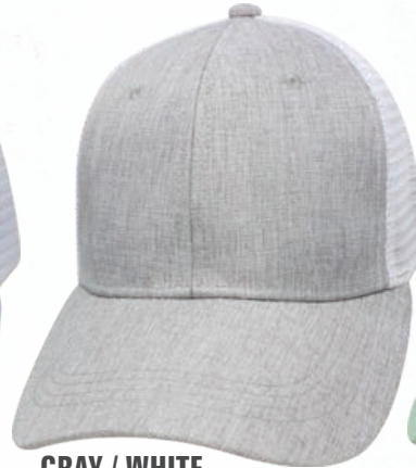
GRAY / WHITE #68RCM-GRA