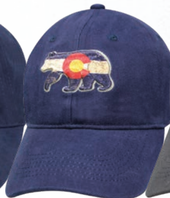
BEAR / NAVY / COLORADO #SVUSBCO-NAV