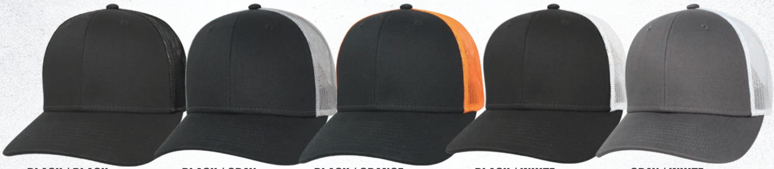
BLACK / BLACK #35RCT-BLB