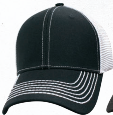
BLACK / WHITE #65RCT-BWH

6 PANEL CAP • COTTON FRONT • CUSTOM DEEP FIT CROWN • REINFORCED FRONT • COTTON SWEATBAND • SEWN EYELETS • SLIGHTLY CURVED BILL • 3PLY STITCHING ON BILL • PERFORMANCE MESH BACK • SNAPBACK CLOSURE * REFLECTIVE MATERIAL SIDE APPLIQUES & TRADITIONAL BILL STITCHING