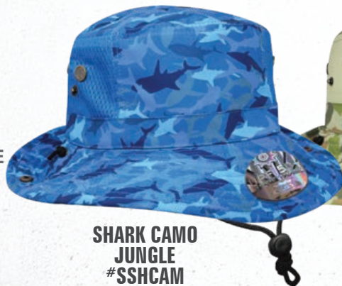
SHARK CAMO JUNGLE #SSH CAM

EXTENDED BRIM - SUBLIMATION PRINTED BOONIE - MESH BACK AND SIDE PANELS - BRASS EYELETS - SNAPS ON EACH SIDE OF BRIM & CROWN - ADJUSTABLE STRING - MICROFIBER SWEATBAND - UPF PROTECTION FACTOR OF 50+ HOLOGRAPHIC STICKER ON BILL