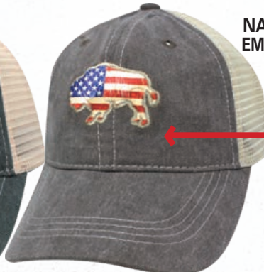
BUFFALO / BROWN / KHAKI #SVUSABF