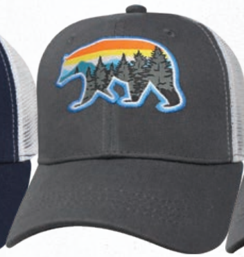
GRAY / WHITE / BEAR #SSUNIC-GRY