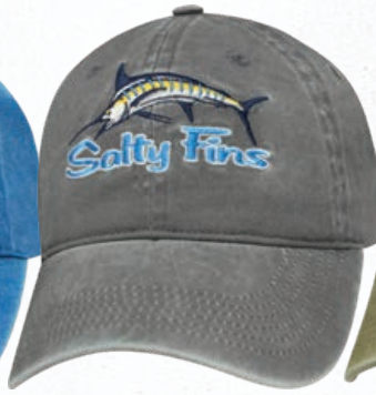
GRAY / MARLIN #SBWVGR