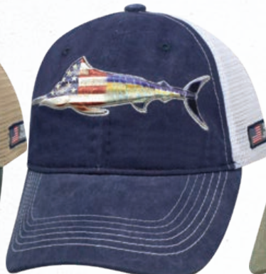
MARLIN / NAVY / WHITE #SVUSMAR