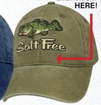
KHAKI / BASS #SBWSFK