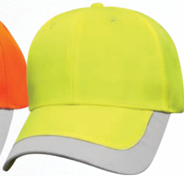
SAFETY YELLOW WITH REFLECTIVE #68SAF-SAFY