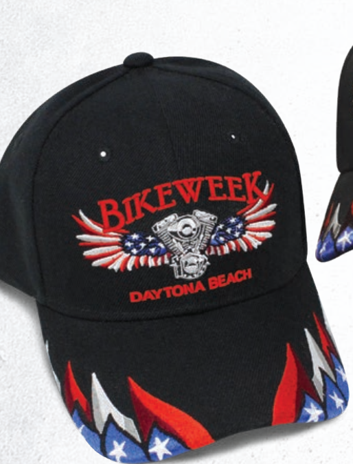
USA WINGED ENGINE #SBBUSWE