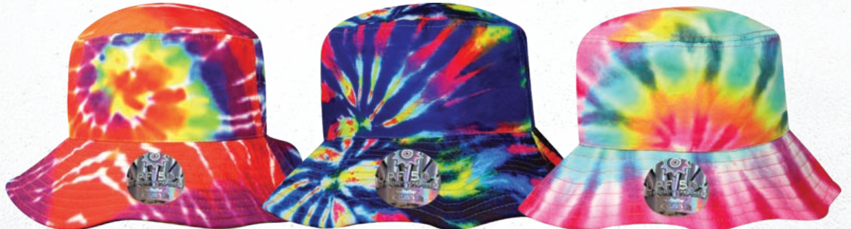
BRIGHT TIE DYE #99TIE-BRI