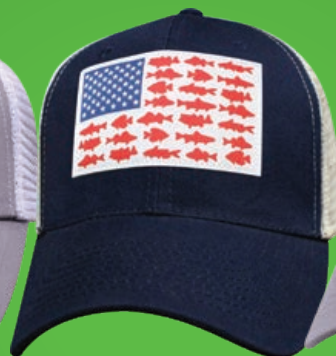
NAVY / WHITE FRESHWATER #SICFFW-NWH