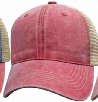
RED / KHAKI #82LPD-RDK