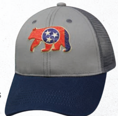
BEAR GRAY / NAVY / TENNESSEE #SVUSBTN-GRY

6 PANEL CAP - SUBLIMATION PRINT ON TEXTURED 3D EMBROIDERY - REINFORCED FRONT - CUSTOM DEEP FIT CROWN - COTTON SWEATBAND - SEWN EYELETS - SLIGHTLY CURVED BILL - MESH BACK - SNAPBACK CLOSURE