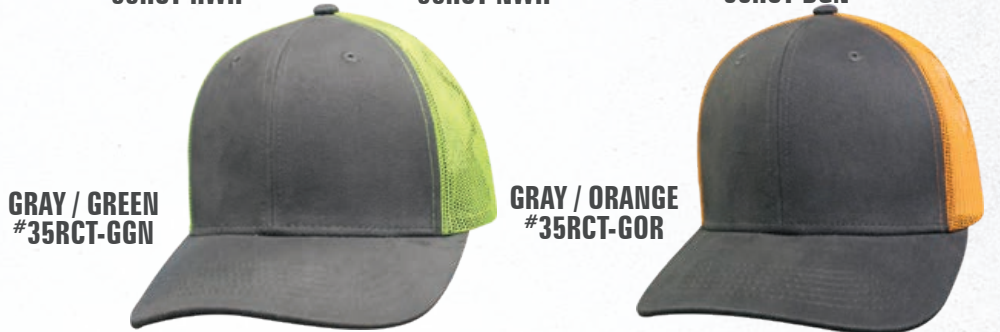
GRAY / GREEN #35RCT-GGN

6 PANEL CAP • CUSTOM DEEP FIT CROWN • REINFORCED FRONT • SELF FABRIC SWEATBAND • SEWN EYELETS • SLIGHTLY CURVED BILL • MESH BACK • SNAPBACK CLOSURE