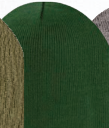
FOREST GREEN #44KNT-FST