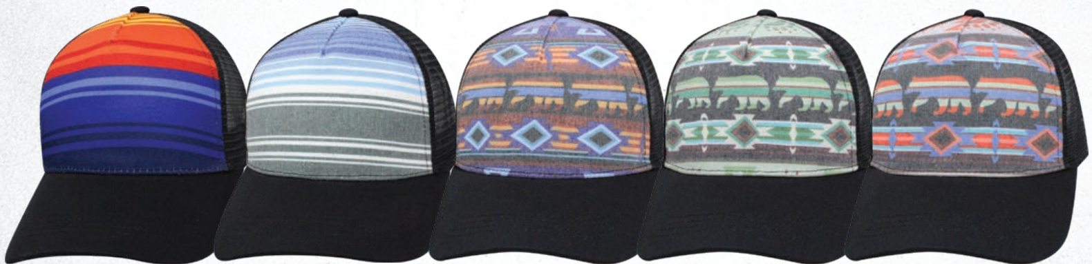
POLY STRIPE SURFIN' / BLACK #56RCT-PSB

5 PANEL CAP - SUBLIMATION PRINT ON POLYESTER KNIT CROWN - CUSTOM DEEP FIT CROWN - REINFORCED FRONT - COTTON SWEATBAND - SLIGHTLY CURVED BILL - MESH BACK - SNAPBACK CLOSURE