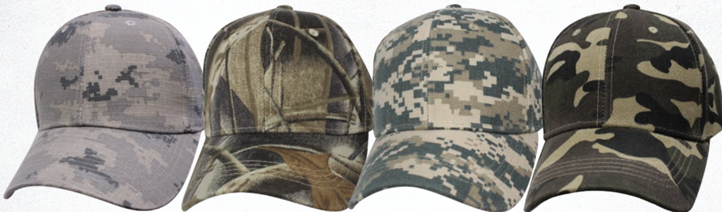
PIXELATED CAMO* #6ECAM

6 PANEL COTTON CAP • LOW CROWN • REINFORCED FRONT • COTTON SWEATBAND • SEWN EYELETS • PRECURVED BILL • HOOK & LOOP CLOSURE *CAP HAS BRASS BUCKLE WITH SELF FABRIC STRAP CLOSURE ^ POLYESTER CAP