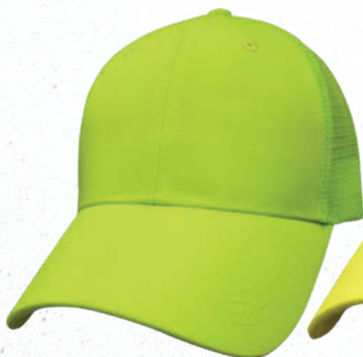
NEON GREEN #95SUN-NGR

6 PANEL NEON MICROFIBER CAP • LOW CROWN • REINFORCED FRONT • SUPER BRIGHT NEON FRONT WITH MATCHING NEON MESH BACK • SELF FABRIC SWEATBAND • SEWN EYELETS • PRECURVED BILL • HOOK & LOOP CLOSURE