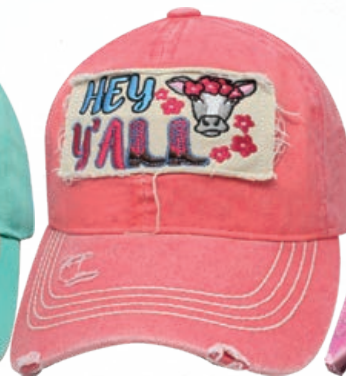
HEY Y'ALL MELON #SBHYBT-MEL