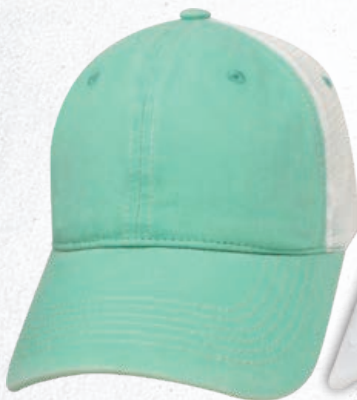
MINT / WHITE #82LPD-MNW