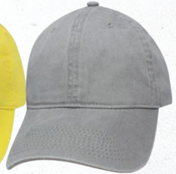
LIGHT GRAY #83RSW-LGR