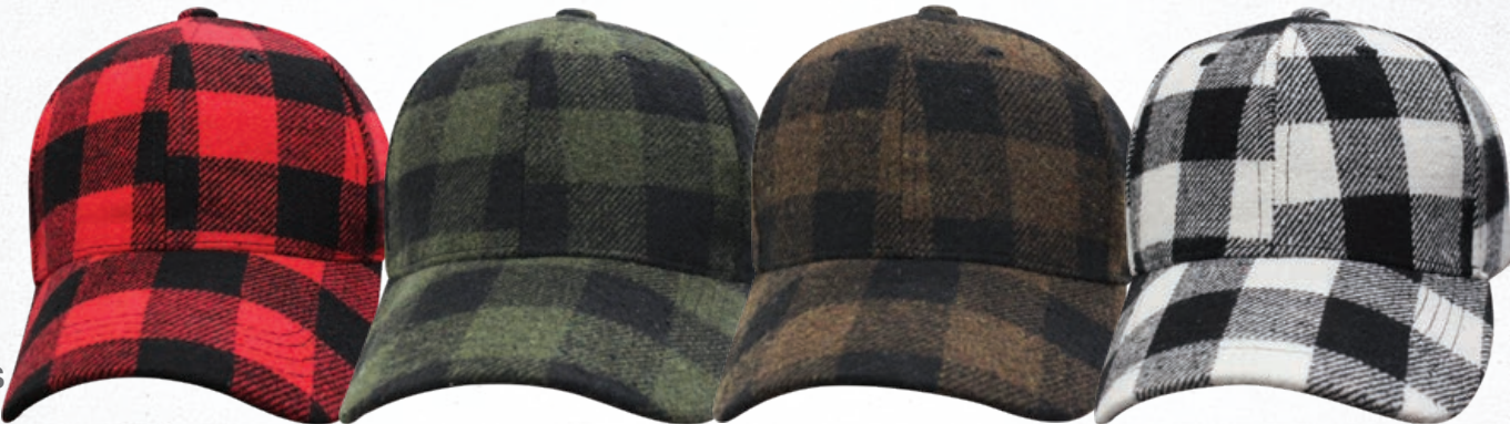
BUFFALO PLAID BLANK #68PLD-BFP

6 PANEL BUFFALO PLAID CAP • LOW CROWN • REINFORCED FRONT • COTTON SWEATBAND • SEWN EYELETS • PRECURVED BILL • BUFFALO PLAID HOOK & LOOP CLOSURE