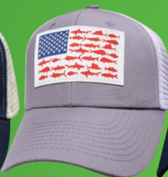
GRAY / WHITE SALTWATER #SICFSW-GWH