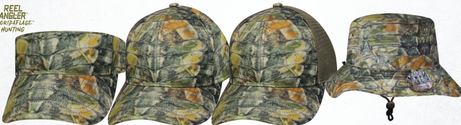
REEL ANGLER® FLORIDAFLAGE™ HUNTING VISOR #SRAFFHV