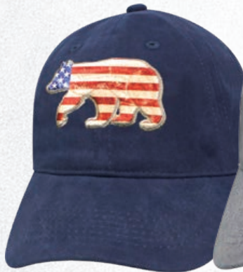
BEAR / NAVY #SVUSAB-NAV

6 PANEL PIGMENT DYED CAP - SUBLIMATION PRINT ON TEXTURED 3D EMBROIDERY - LOW CROWN - RELAXED FRONT - COTTON SWEATBAND - SEWN EYELETS - SLIGHTLY EXTENDED PRECURVED BILL - HOOK & LOOP CLOSURE