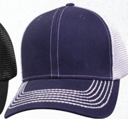
NAVY / WHITE #65RCT-NWH