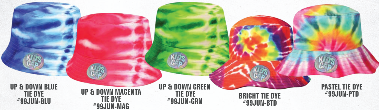
UP & DOWN BLUE TIE DYE #99JUN-BLU

SUBLIMATION PRINTED BUCKET - UPF PROTECTION FACTOR OF 50+ COTTON SWEATBAND - HOLOGRAPHIC STICKER ON BILL - FOR AGES 4-9 - SIZE FITS 53CM TO 57CM RANGE