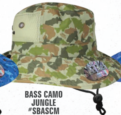
BASS CAMO JUNGLE #SBASC M