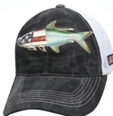
TARPON / CHARCOAL / WHITE #SVUSTAR