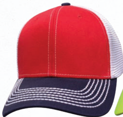
RED / WHITE / BLUE #65RCT-RWB