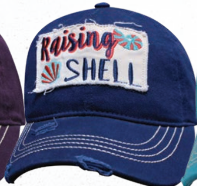
RAISING SHELL NAVY #SBRASH-NAV