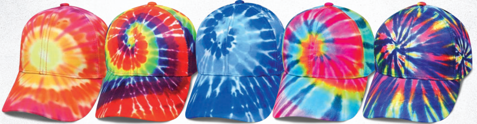
SUNSET TIE DYE #95TIE-SNR

6 PANEL CAP • ALL OVER SUPER BRIGHT SUBLIMATION PRINTED TIE DYE PATTERN • LOW CROWN • REINFORCED FRONT • COTTON SWEATBAND • PRECURVED BILL • HOOK & LOOP CLOSURE