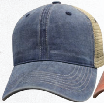
NAVY / KHAKI #82LPD-NVK