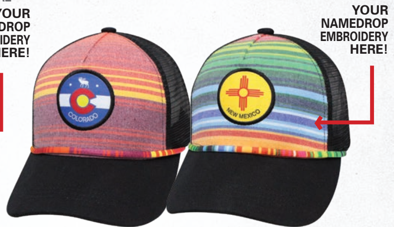
SUNSET / COLORADO #SPSSCO

5 PANEL CAP - SUBLIMATION PRINTED CROWN - WOVEN APPLIQUE ON CROWN - ROPE ON BILL - CUSTOM DEEP FIT CROWN - REINFORCED FRONT - COTTON SWEATBAND - SLIGHTLY CURVED BILL - MESH BACK - SNAPBACK CLOSURE