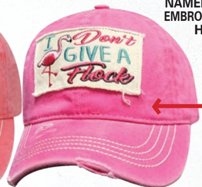
I DON'T GIVE A FLOCK RASPBERRY #SBKFLK-RAS