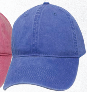
SKYDIVER BLUE #83RSW-SDB