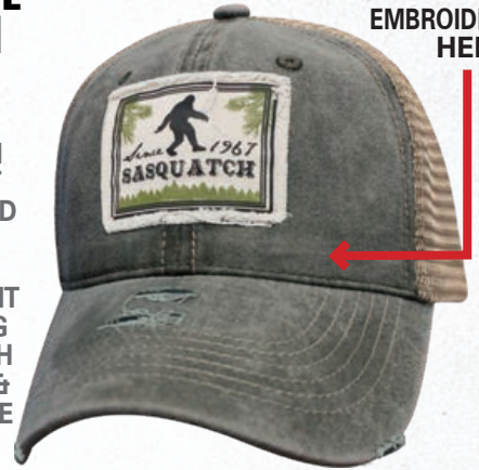
RUM LABEL SQUATCH #SRLSAS

6 PANEL CAP - PIGMENT DYED CROWN & BILL - PRINT ON DISTRESSED APPLIQUE ON CROWN - RELAXED FRONT - DISTRESSING ON BILL - MESH BACK - HOOK & LOOP CLOSURE