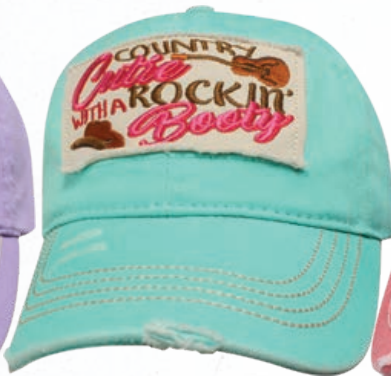
COUNTRY CUTIE MINT #SBKCCT-MIN