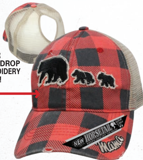
VINTAGE PLAID MAMA BEAR #SHSTPM