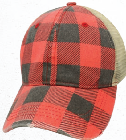
BUFFALO PLAID / KHAKI #82BUF-PLD

6 PANEL WASHED CAP • LOW CROWN • RELAXED FRONT • POPLIN SWEATBAND • SEWN EYELETS • DISTRESSING ON PRECURVED BILL • MESH BACK • SNAPBACK CLOSURE