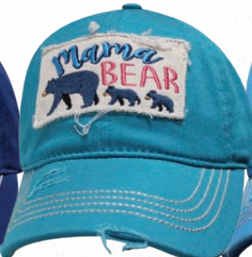
MAMA BEAR TEAL #SMBEAR-TEA