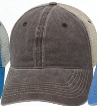
BROWN / KHAKI #82LPD-BKH