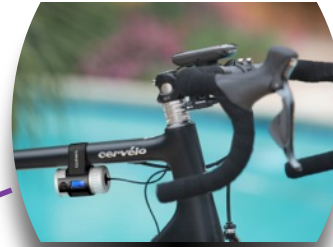
Bike mount accessory