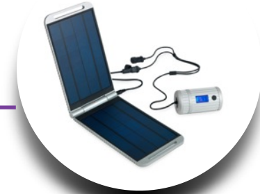
Solar panel accessory