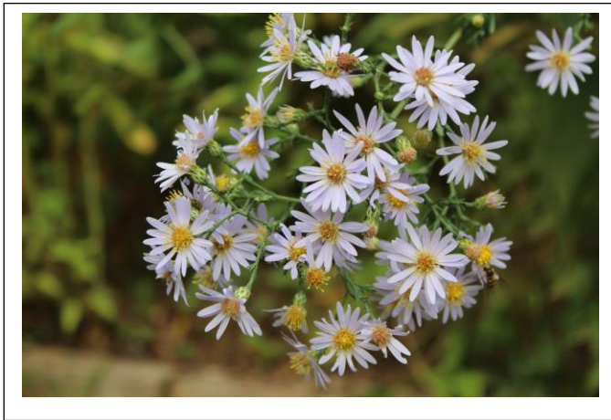
Fall Asters (The seeds were a gift from one of our seed swap friends last year)