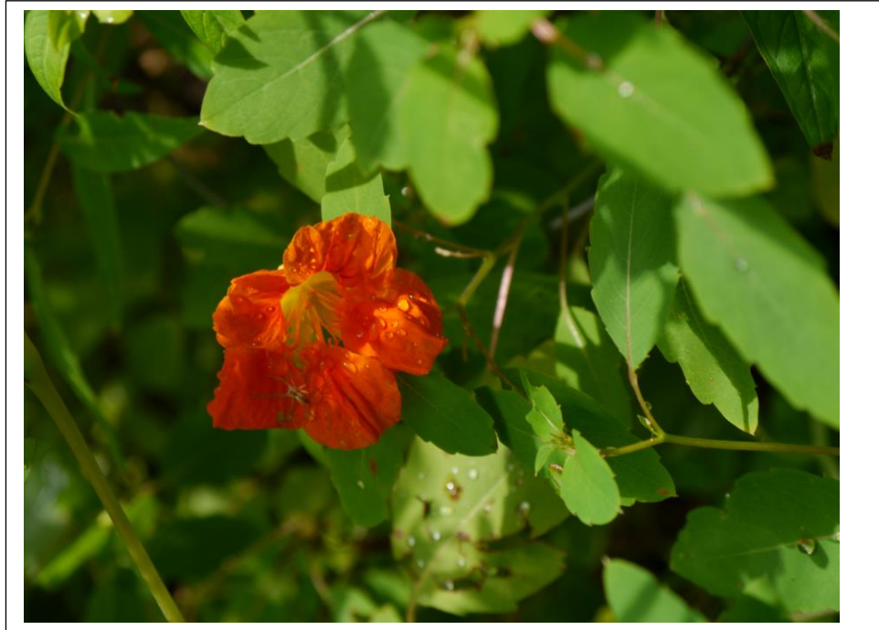
Jewel Weed ( Impatiens capensis )