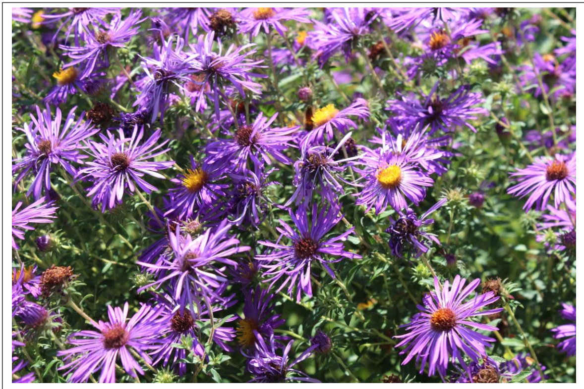
New England Asters ( Symphotrichum novae-angliae )

Here are a few pictures of what's currently blooming in our gardens. New England Asters ( Symphotrichum novae-angliae ) (For more information, see page 83 in " Let The Earth Breathe ." ) The hummingbirds are having a feast with the Jewel Weed ( Impatiens capensis .) The pale blue asters were a gift from one of the seed swap members last year. Maximilian Sunflowers ( Helianthus maximiliani ) are survivors and come back stronger every year. This year, a few of them cropped up in unexpected places, so I think the birds really like the seeds. Obedient Plant ( Physostegia virginiana ) has been a welcome addition to our fall garden. These seeds were gifts from last year's swap, as well.