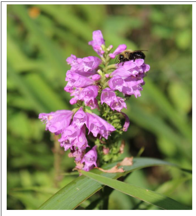
Obedient Plant ( Physostegia virginiana )