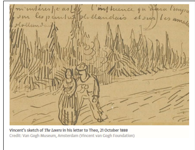
Vincent's sketch of The Lovers in his letter to Theo, 21 October 1888

If you know of anyone who is looking for a speaker, the Kentucky Humanities Speakers Bureau is great about helping to subsidize appearances. I'm also giving talks about " A Promise Moon " and how it relates to the Underground Railroad in Kentucky, as well as gardening with native plants and " Let The Earth Breathe ." If you or anyone you know would like to schedule a talk, here's the link .