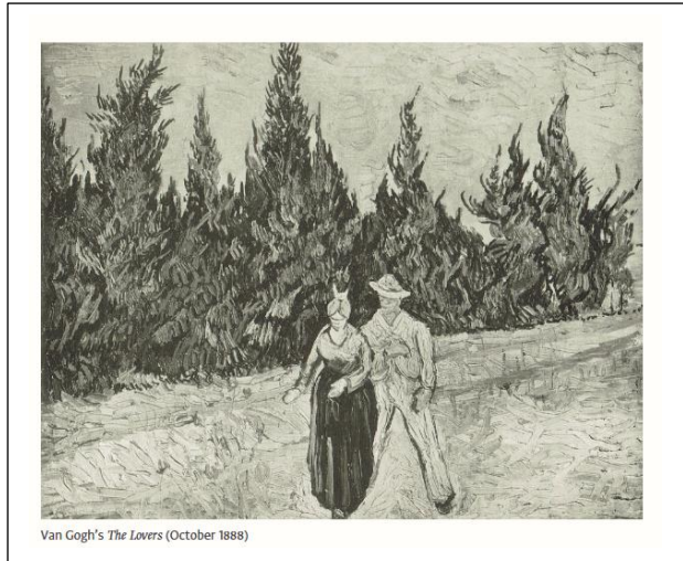
Van Gogh's The Lovers (October 1888)

The Lovers is another painting that has been missing since World War II. There are no known color photos of this canvas. However, Van Gogh drew a sketch of the painting in one of his letters, which is also a plot point in Stealing Van Gogh .